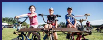
Picnic in the Park 20 January–24 March