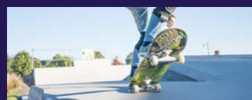
Summer Skate Jams 20 January–24 February