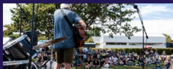
A Month of Sundays Sundays, February and March