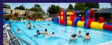
Summer Pool Parties 9 January–12 February