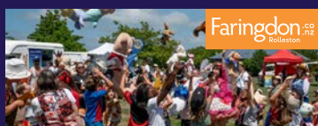
Teddy Bears' Picnic 12 January