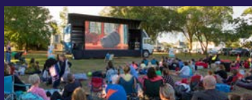
Outdoor Movies 3 December–26 March

Keep an eye out for our jam-packed guide in your mailbox or at any Council facility, available from 1 December.