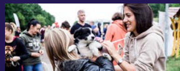
NEW Bark in the Park 27 February