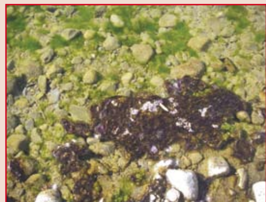
The dark brown algae in this photo is toxic. Stay away from it in the water and along the shoreline. The green algae is healthy and does not pose any threat.

The toxic algae, Phormidium, is being blamed for the death of a dog this weekend in the Selwyn River at Chamberlains Ford. At least two other dogs were taken to the vet suffering seizures.