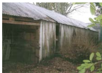
The 19th Century Implement Sheds before restoration work begins

The Selwyn Heritage Fund is a contestable fund that is open for applications around May/June each year. To find out about funding your next project please contact Emma Bishop on 347 2955 or 318 8338. You can also see our website for more details.