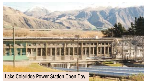
Lake Coleridge Power Station Open Day

Icon events include the South Island Agricultural Field Days at Lincoln; the Country Fair and Vintage Rally in Leeston; the Malvern A & P Show at Sheffield and the opportunity to view New Zealand's oldest operating hydro electric power station at the Lake Coleridge Open Day.