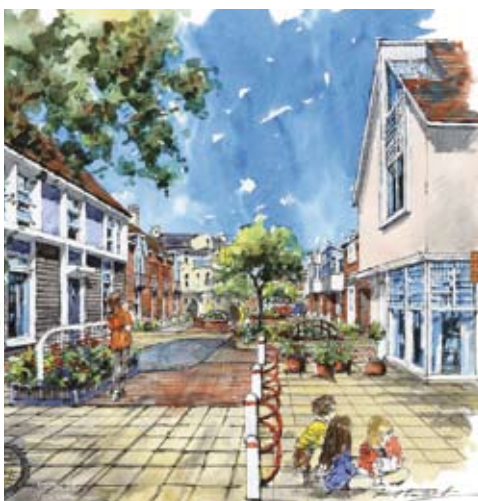
Could this be tomorrow's Rolleston?