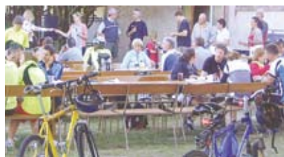
Last Week's Bike for Breakfast in Lincoln

The Lincoln Fire Brigade Open Day goes from 10am to 3pm at the Lincoln Fire Station on James Street. Fire appliance demonstrations will include "Jaws of Life", fire extinguishers, a kitchen fire simulation and a live fire simulation. The NZ Fire Service, St Johns, NZ Police, Civil Defence