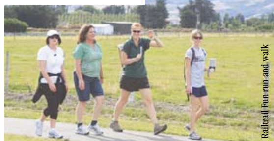
Railtrail fun run and walk

WOW you guys rock! Thanks to the thousands of cyclists, walkers and runners who took part in Bikewise Month.