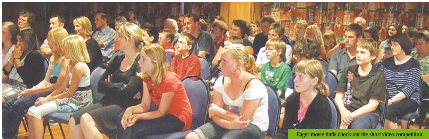
Eager movie buffs check out the short video competition