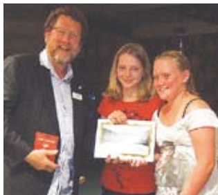
Prebbleton School collects a runner-up award

However, next year's competition should be easier because they have all year to get their next blockbusters made.