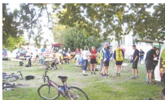
Lincoln Bike-to-Work Breakfast