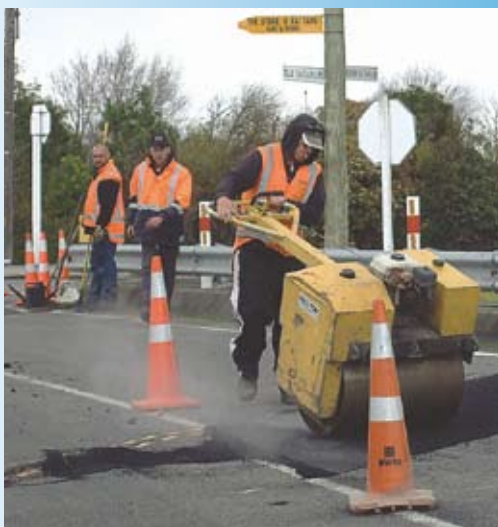
Road repairs at Tai Tapu