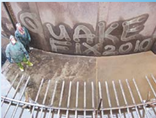
Sewerage Plant Repairs – Rolleston