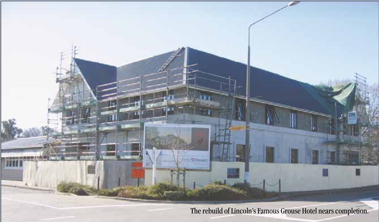
The rebuild of Lincoln's Famous Grouse Hotel nears completion.