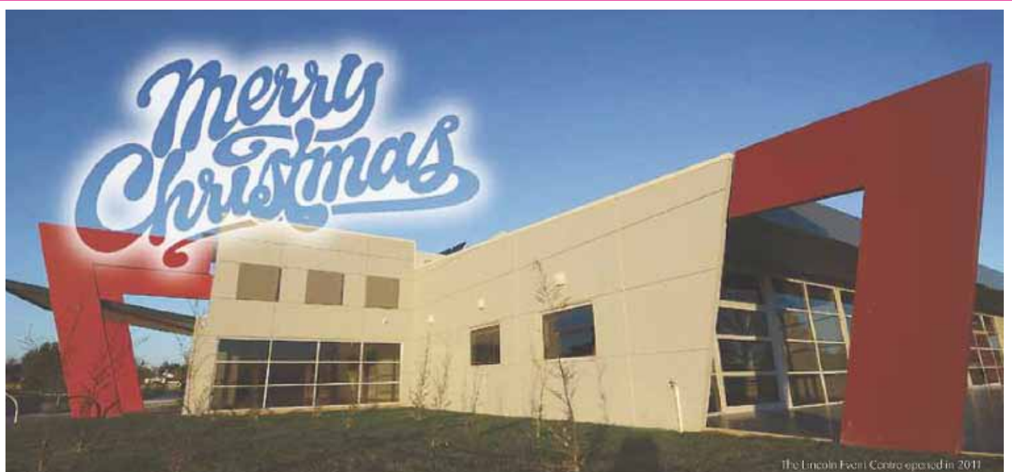
The Lincoln Event Centre opened in 2011

We also have a Facebook page "Lincoln Event Centre", so "like" us and hear about activities, programmes and news updates.