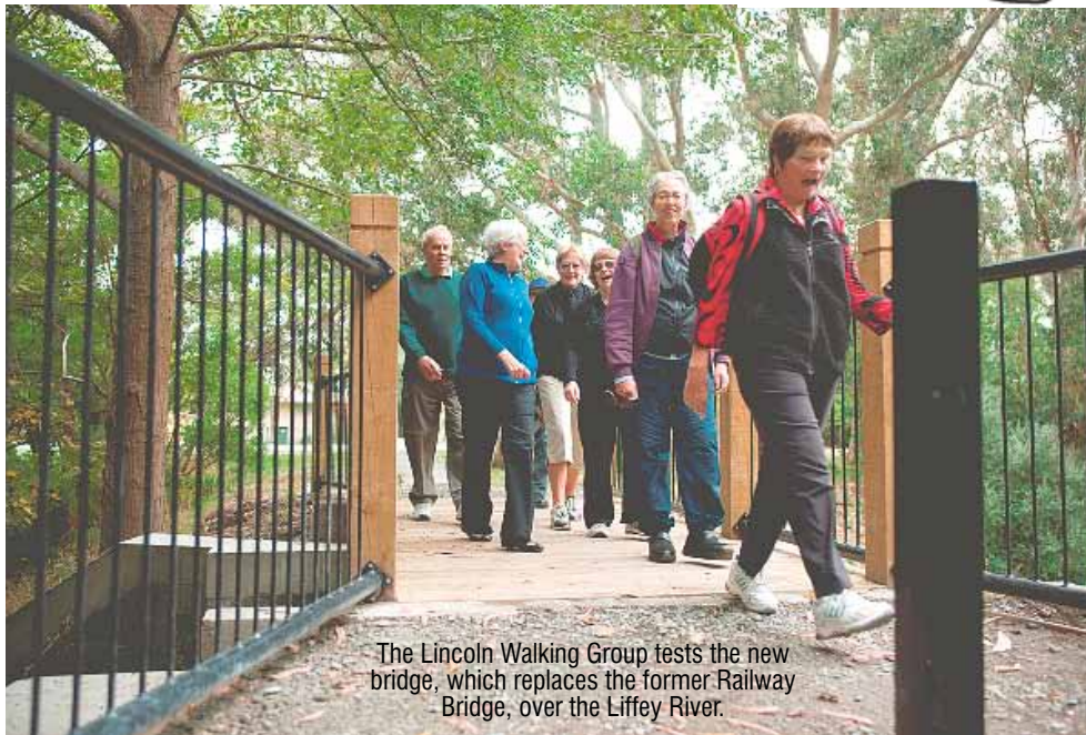
The Lincoln Walking Group tests the new bridge, which replaces the former Railway Bridge, over the Liffey River.