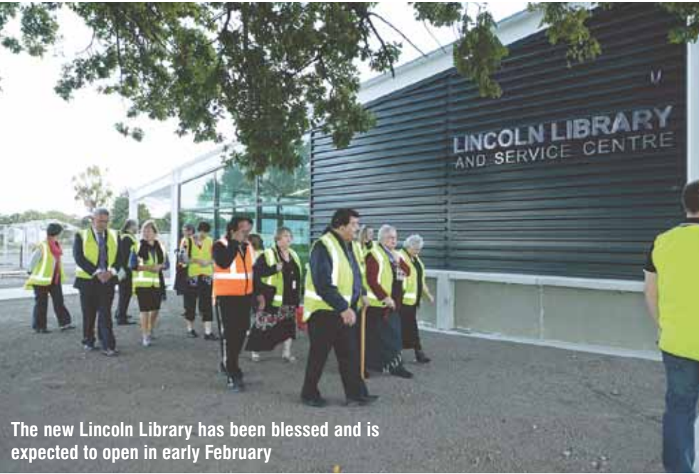
The new Lincoln Library has been blessed and is expected to open in early February

The new Lincoln Library has been officially blessed and work is continuing to prepare the building for opening. The library was blessed at a dawn ceremony involving representatives from Te Taumutu Runanga, the Mayor, library staff and other guests last Friday. The ceremony involved a sod, originally dug before construction of the library began, being returned to a planter box at the site and a blessing of the building. This week library staff will start to transfer books from the current library to the new building. To allow this work to happen the current library will close from Wednesday 22 January – Saturday 25 January. The Council’s mobile library will be visiting Lincoln Library on Wednesday 22 January from 3 – 4pm and on Thursday 23 January from 9.30 – 11am so that people can still pick up and drop off books during the closure.