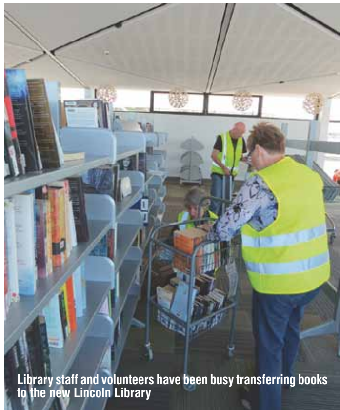
Library staff and volunteers have been busy transferring books to the new Lincoln Library

We hope to open the library to the public very soon and the mobile library will be visiting Lincoln on a regular basis until the library opens – please check the Council website for the latest news, www.selwyn.govt.nz .