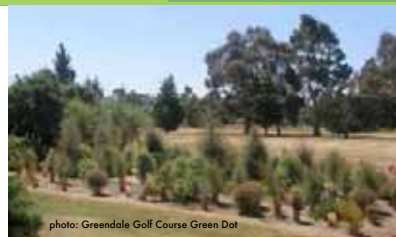
photo: Greendale Golf Course Green Dot

Thinking of planting some natives? Learn how to effectively restore native habitats, save time and money at this free event.