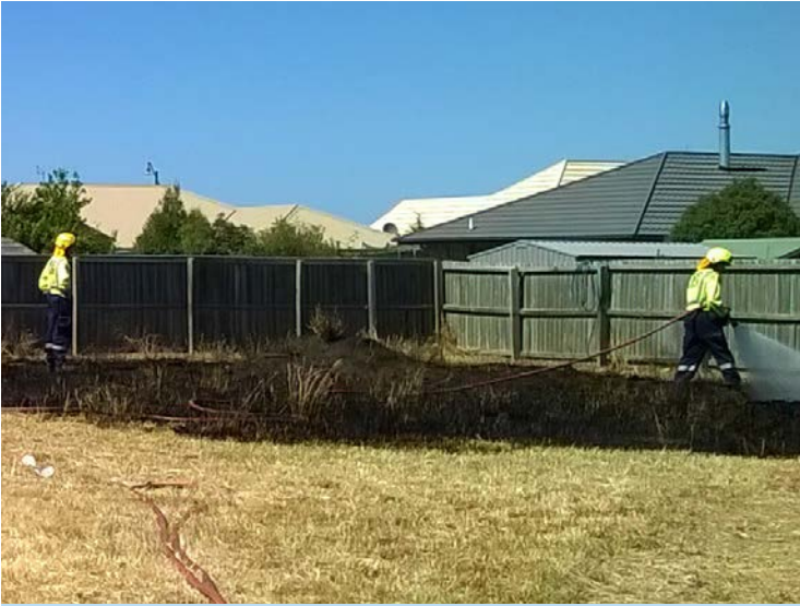
In the current conditions sparks can easily ignite a fire. At this Rolleston property sparks from a lawn mower recently started a fire.