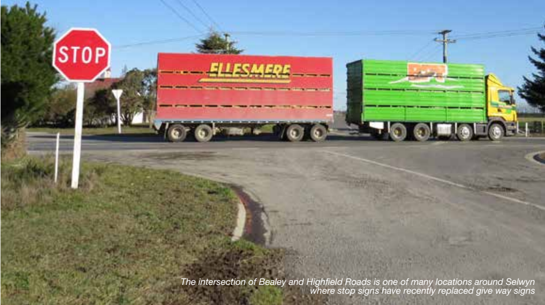
The intersection of Bealey and Highfield Roads is one of many locations around Selwyn where stop signs have recently replaced give way signs