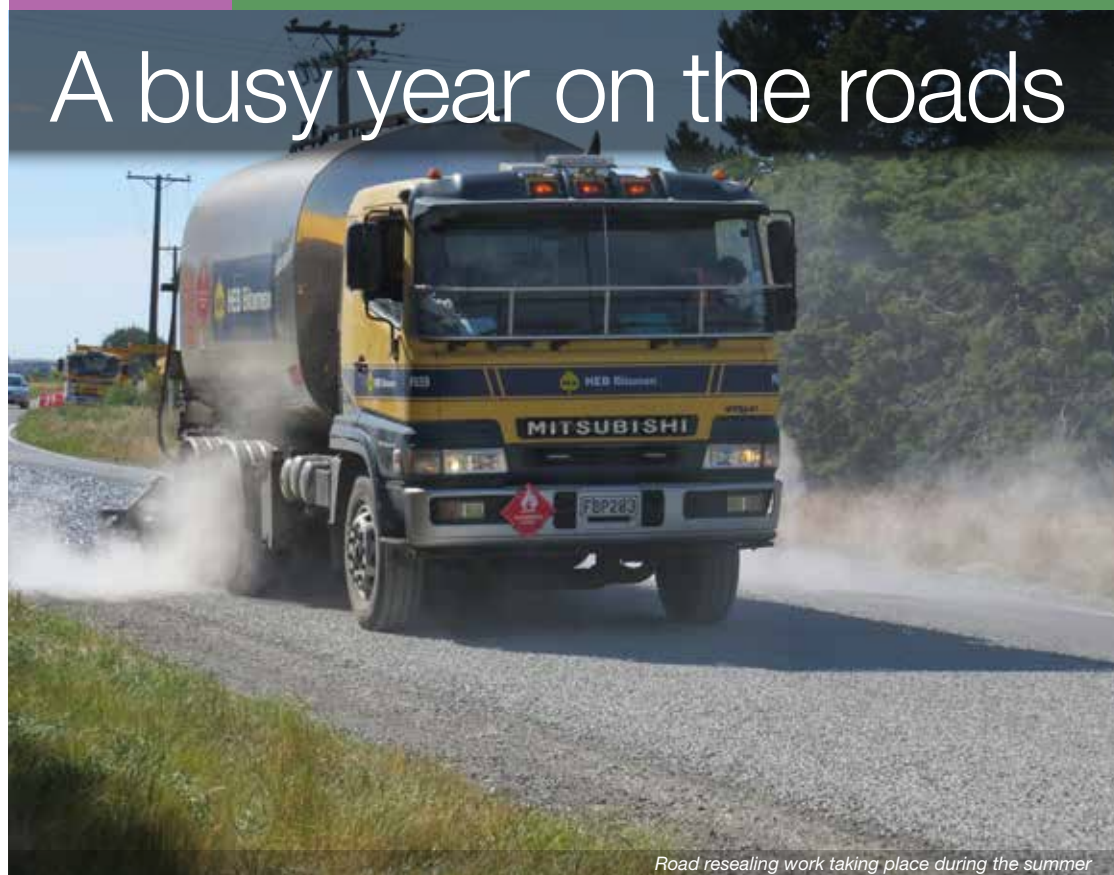
Road resealing work taking place during the summer