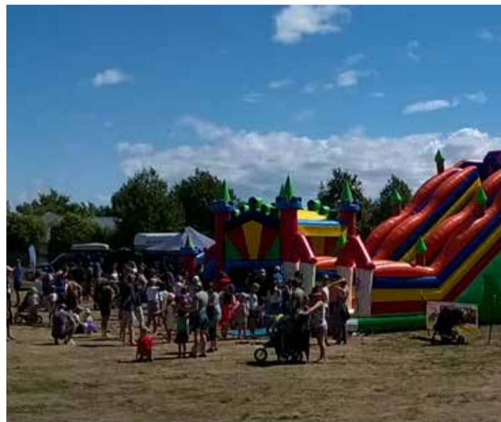
Children's Day was one of many events to receive Council funding over the past year

Applications for funding for events planned over the next year must be received by 31 July 2015. Applications are open from 1 July 2015 - information about the fund is available online at www.selwyn.govt.nz/eventsfund