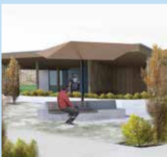
Dunsandel community Centre

*For more detail on these projects please check the Council website, www.selwyn.govt.nz .