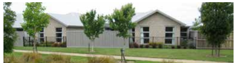
Open-style fencing with some landscaping allows for passive surveillance of the reserve improving the safety of people using this area

The responsibility and costs to remove or change fences that do not meet District Plan requirements lies with the landowner, so please contact the Council before you start building a fence. For advice on fencing rules please phone 03 347 2800 and ask for the Duty Planner.