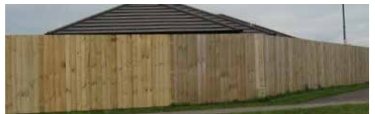
Un-stained closed-board fencing creates a blank barrier