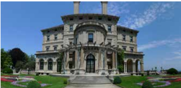
The Breakers in Newport is a 30 minute drive from Coventry and was the summer home of the Vanderbilt family.

The Coventry Sister City Committee will visit Selwyn in March 2016 and the Selwyn Sister Cities Committee is expected to reciprocate hospitality including homestays.