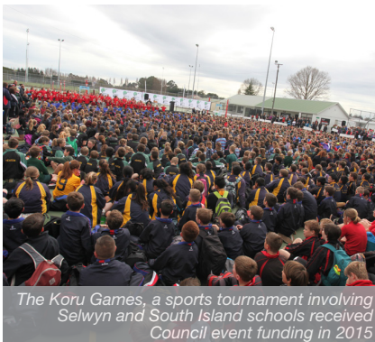
The Koru Games, a sports tournament involving Selwyn and South Island schools received Council event funding in 2015

Applications for events planned over the next year (September 2016 – August 2017) must be received by 1 August 2016 . Information about the fund is available at www.selwyn.govt.nz/eventsfund .