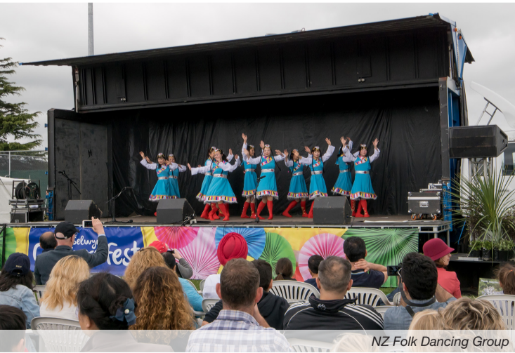
NZ Folk Dancing Group