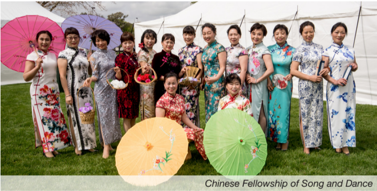
Chinese Fellowship of Song and Dance

CultureFest 2017 was an outstanding success with around 3,000 people enjoying a range of performances from 20 different ethnic and cultural backgrounds. The crowd enjoyed food from a range of vendors each representing a different country. There were plenty of craft, games and activities including Iranian hand crafts, Mah Jong, Henna Tattoos, face painting, balloon art, highland games, Japanese traditional games and Te Taumutu kiwiana products and craft. The turnout from Selwyn residents, performers, ethnic and cultural groups and food vendors showcased Selwyn’s growing diversity and welcoming nature for newcomers and migrants.