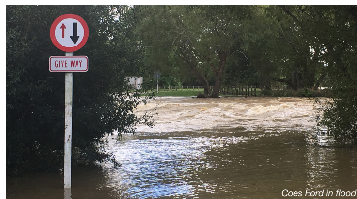
Coes Ford in flood

You can join Selwyn Gets Ready to receive vital emergency information relevant to the area where you live. Messages are sent via email and more urgent messages requiring immediate action will be sent to your mobile selwyn.getsready.net .