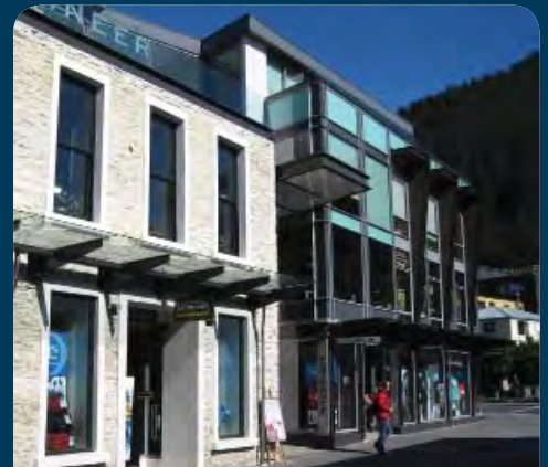
More office space