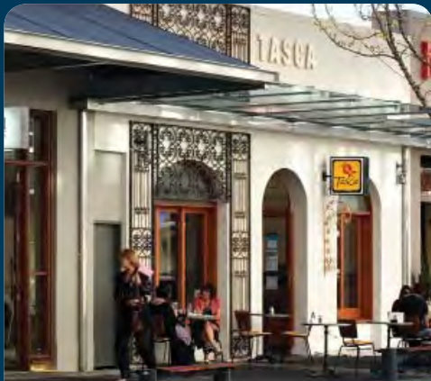
More small shops

What would you like to see in the town centre?