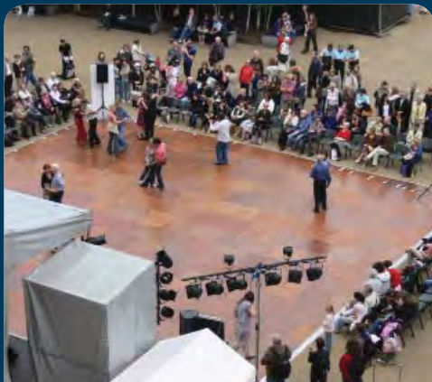
Entertainment & cinema