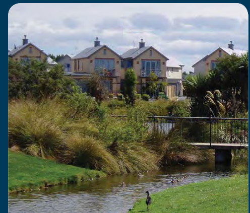
High density housing