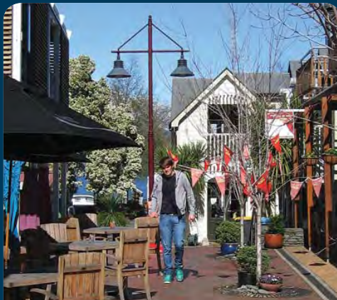
Better circulation & pedestrian laneways