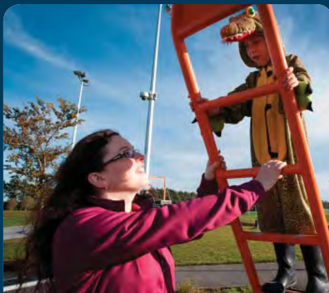
Urban park & play areas