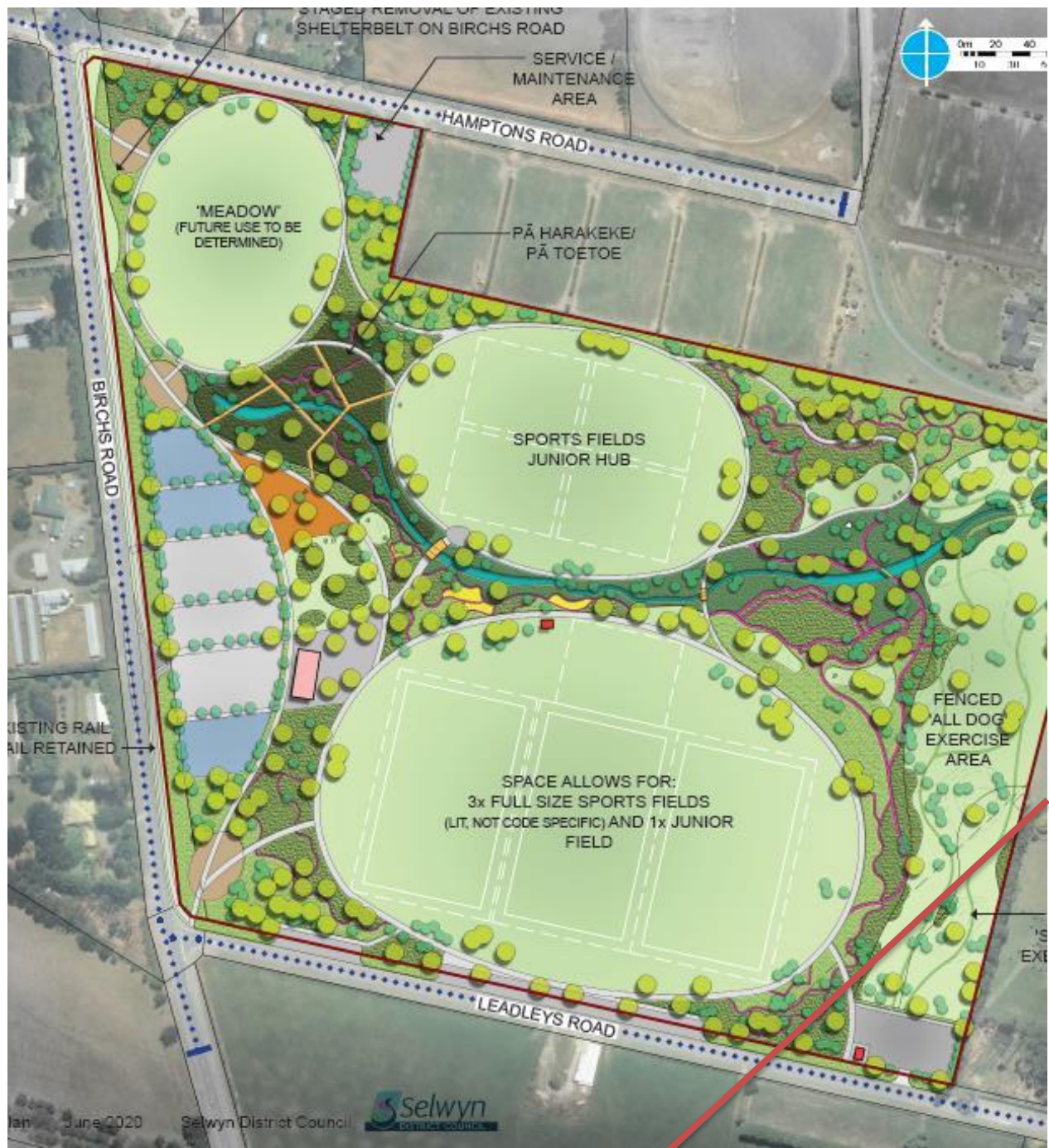
Figure 2. Proposed Master Plan and existing transmission line (shown as —)