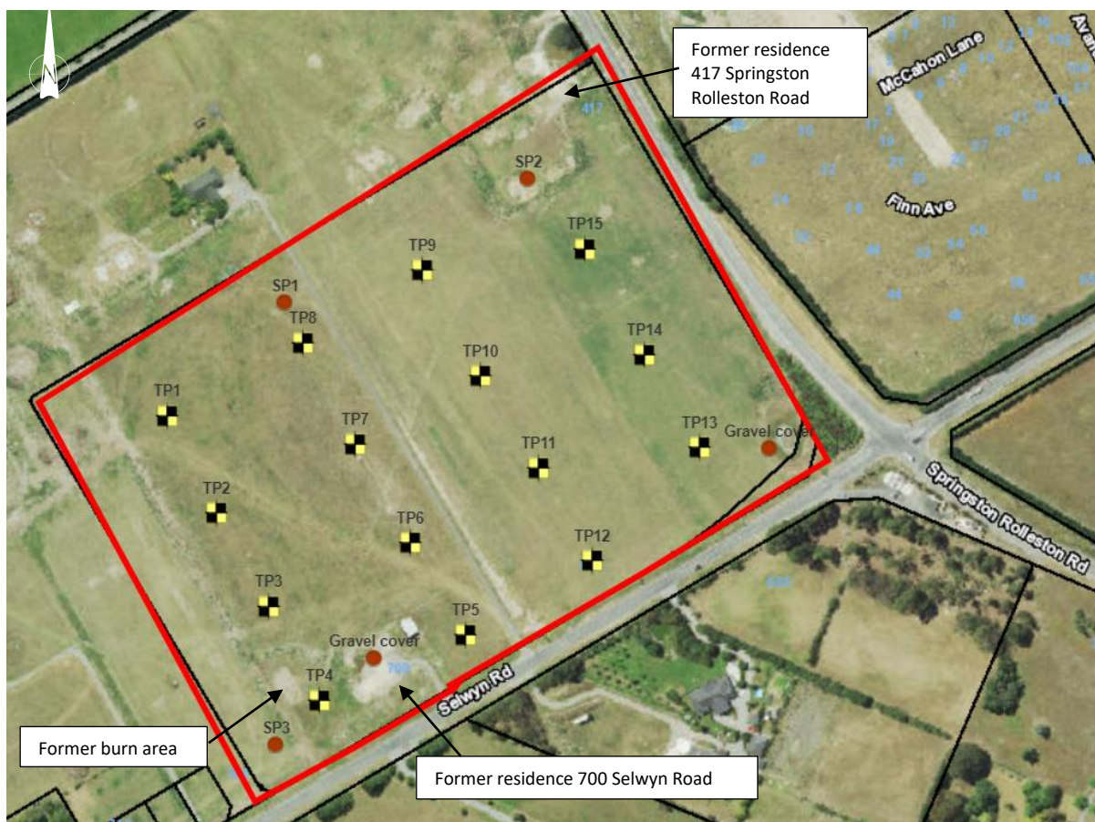
Figure 2.1: The Site (within the red boundary). Three stockpiles (orange feature points) were found onsite; SP1, SP2, and SP3, as well as patches of gravel cover. The yellow/black squares indicate the approximate soil sampling locations from within the site, labelled as test pit 1 through to test pit 15 (TP1 – TP15).