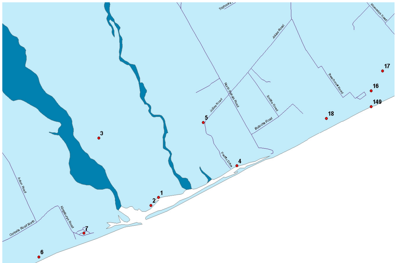
Figure 7: Map showing location of all recorded archaeological sites in general Rakaia area. Site 4, indicated to the right of Pacific Drive represents the Rakaia Moa Hunter site