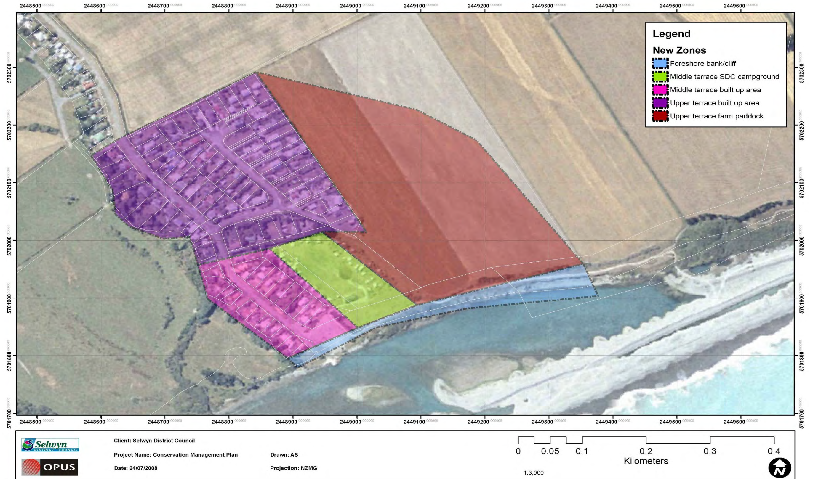
Map 1 Map showing location of management areas Rakaia Huts