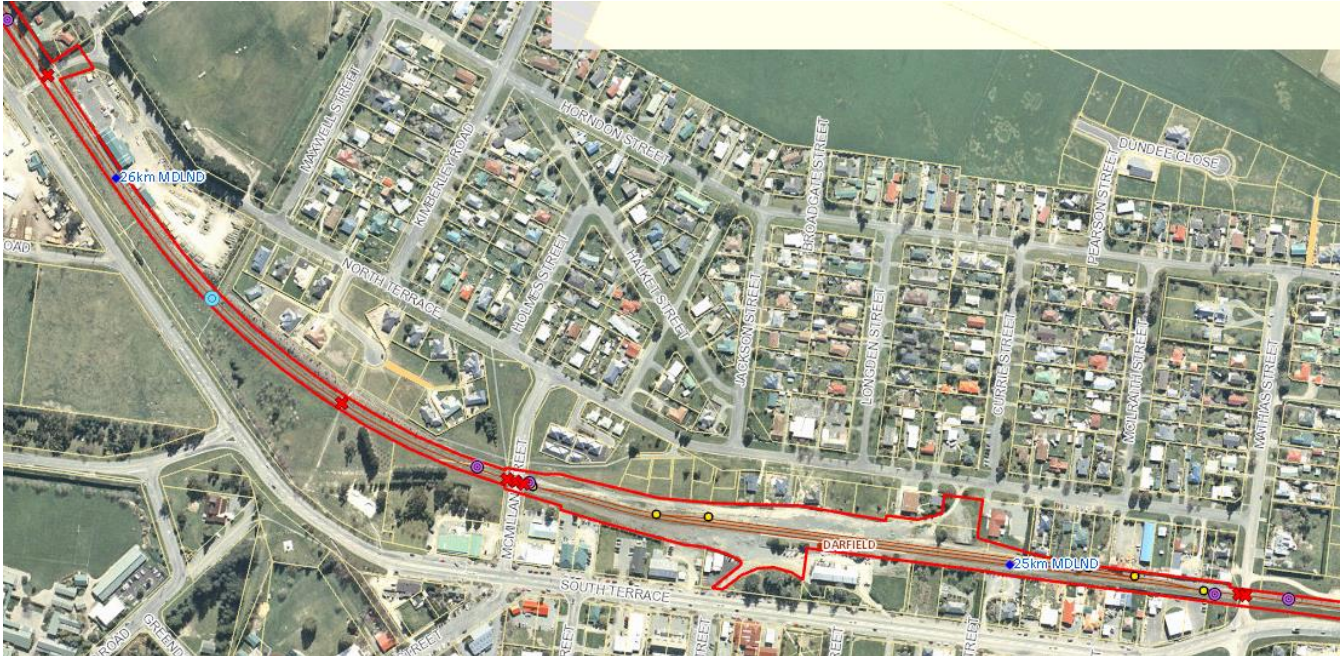
Figure 1. Location of level crossings

There are a number of level crossings in the vicinity of the proposed development area. These are denoted by the red crosses on the below figure.