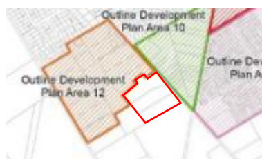
Appendix 38 OSDP

The OSDP identifies and provides for 12 ODP areas at Rolleston. The Site is not within an adopted ODP site. The two nearest are ODP 10 and ODP 12 that cradle this Site to the NW and NE (Site outlined in red).