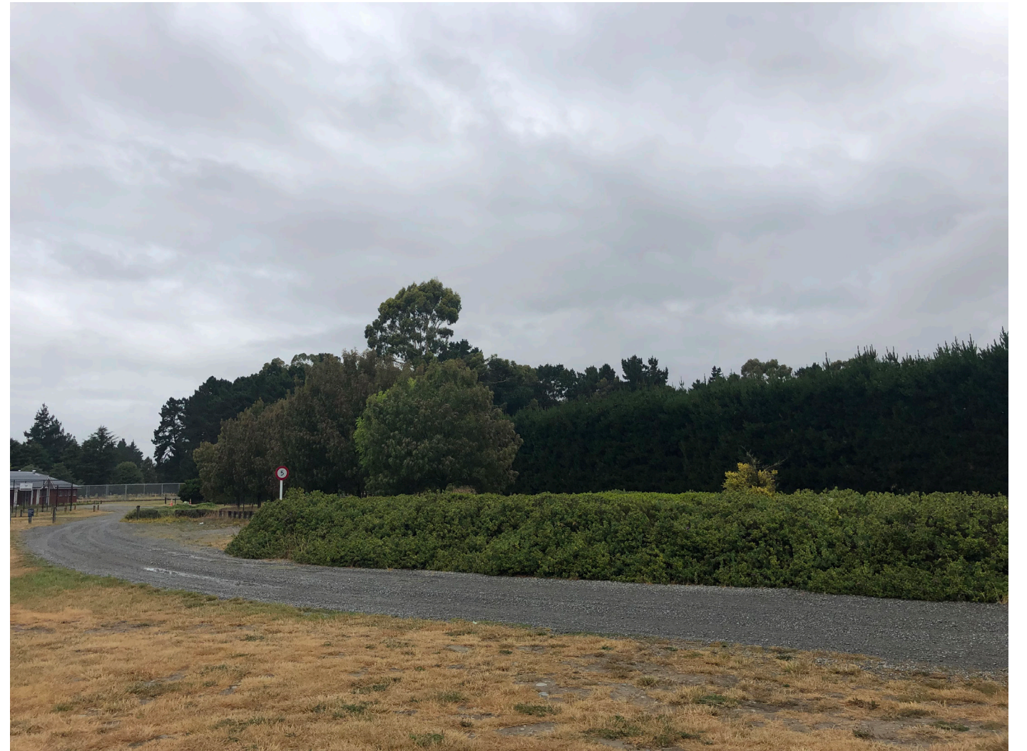
FIGURE 10: View north from within entrance to Weedons Reserve

Thick vegetation shown along the western boundary shown,. Also shown the Weedons Reserve golf club building.