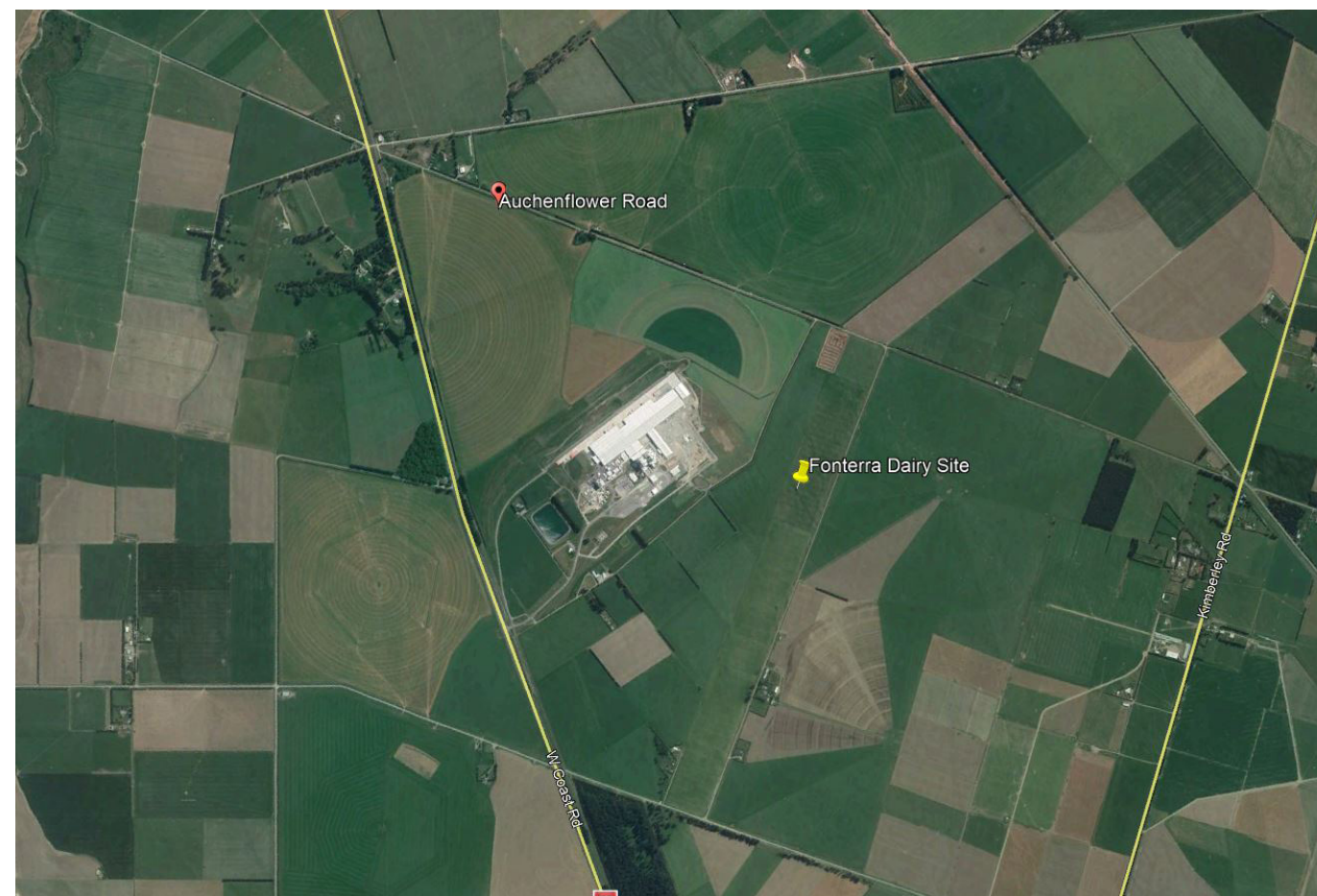
FIGURE 3: Example of Existing (DPMA) Area Development and Built forms at Fonterra and Synlait - comparative study for built form coverage