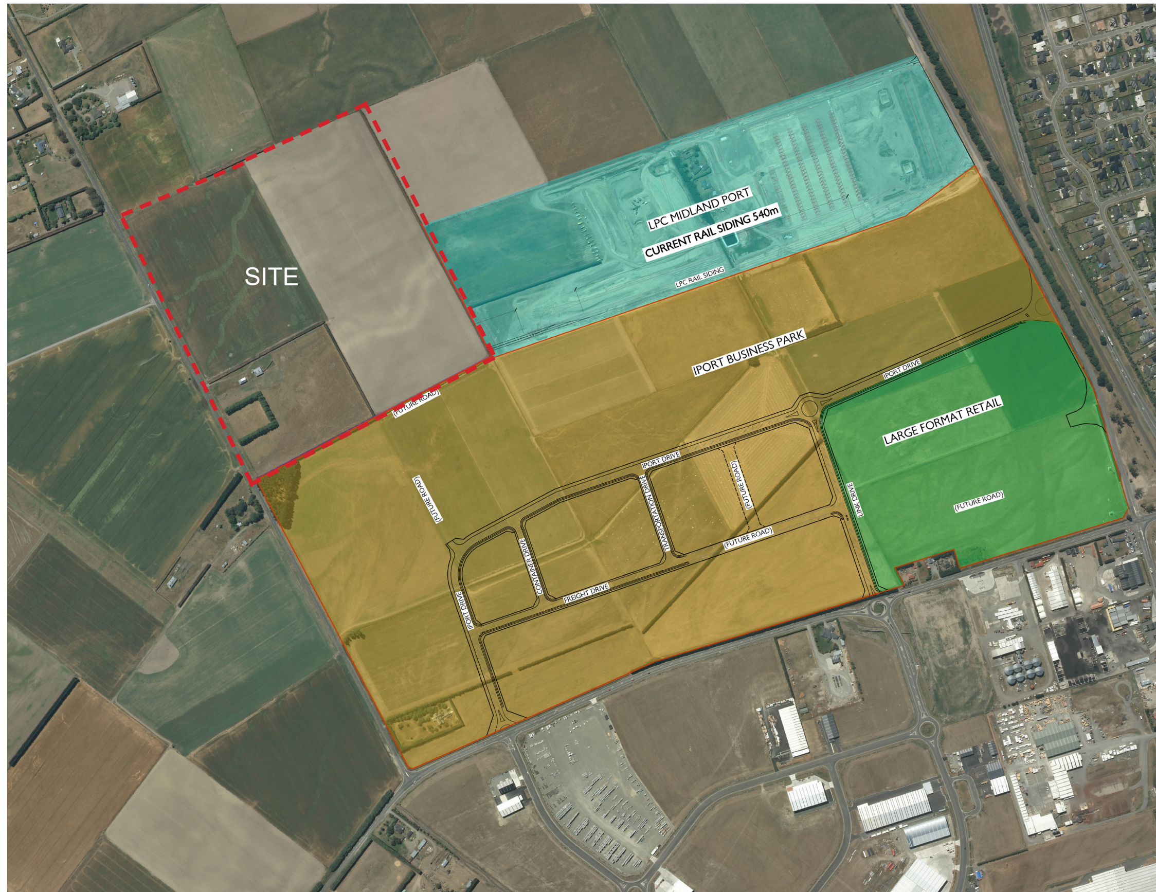
FIGURE 2: Site adjacent to IPort and LPC Midland Port development context to the west