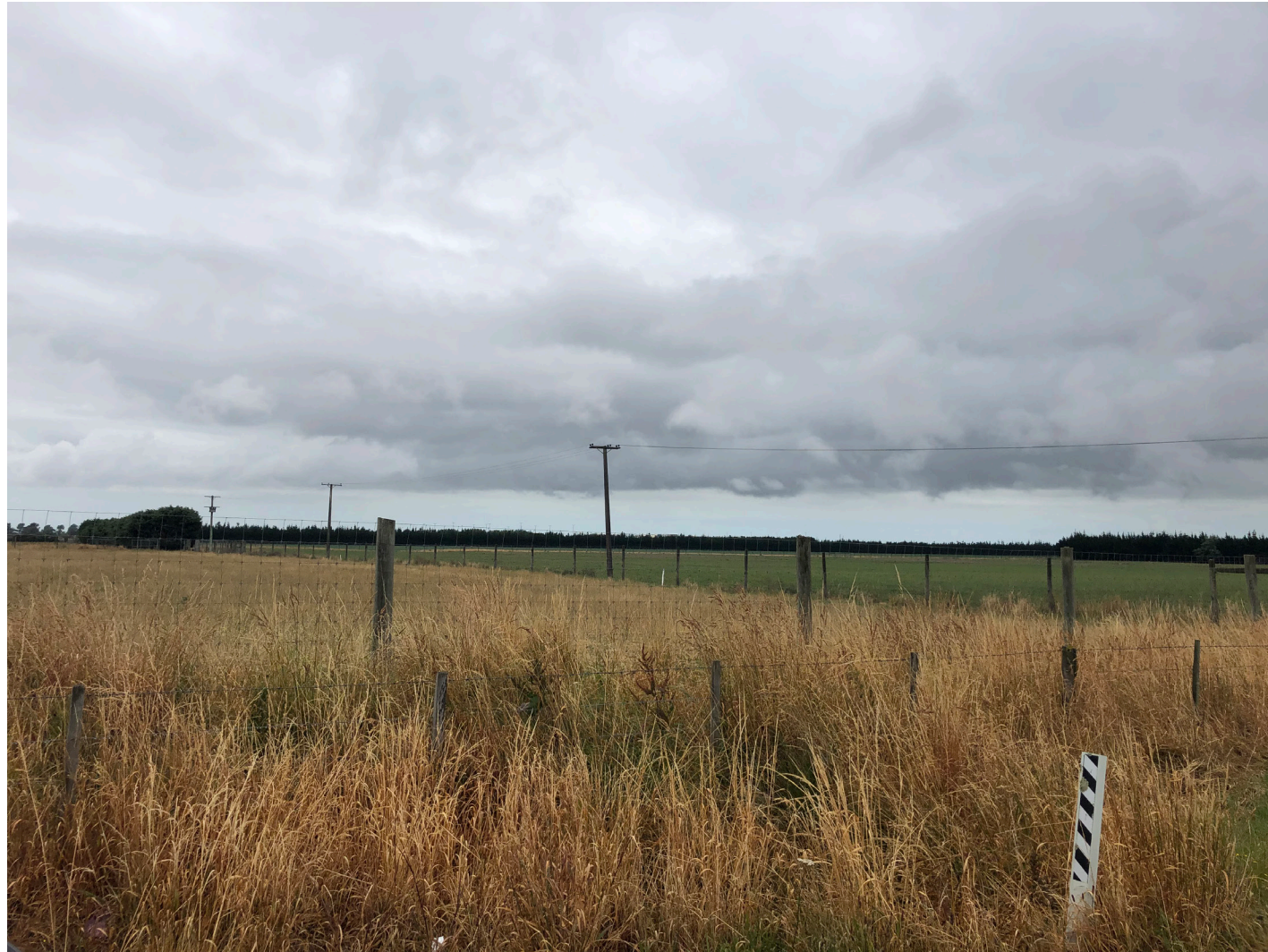
FIGURE 11: View northwest from Weedons Ross Road Open space and rural paddocks across to subject site with shelterbelts.