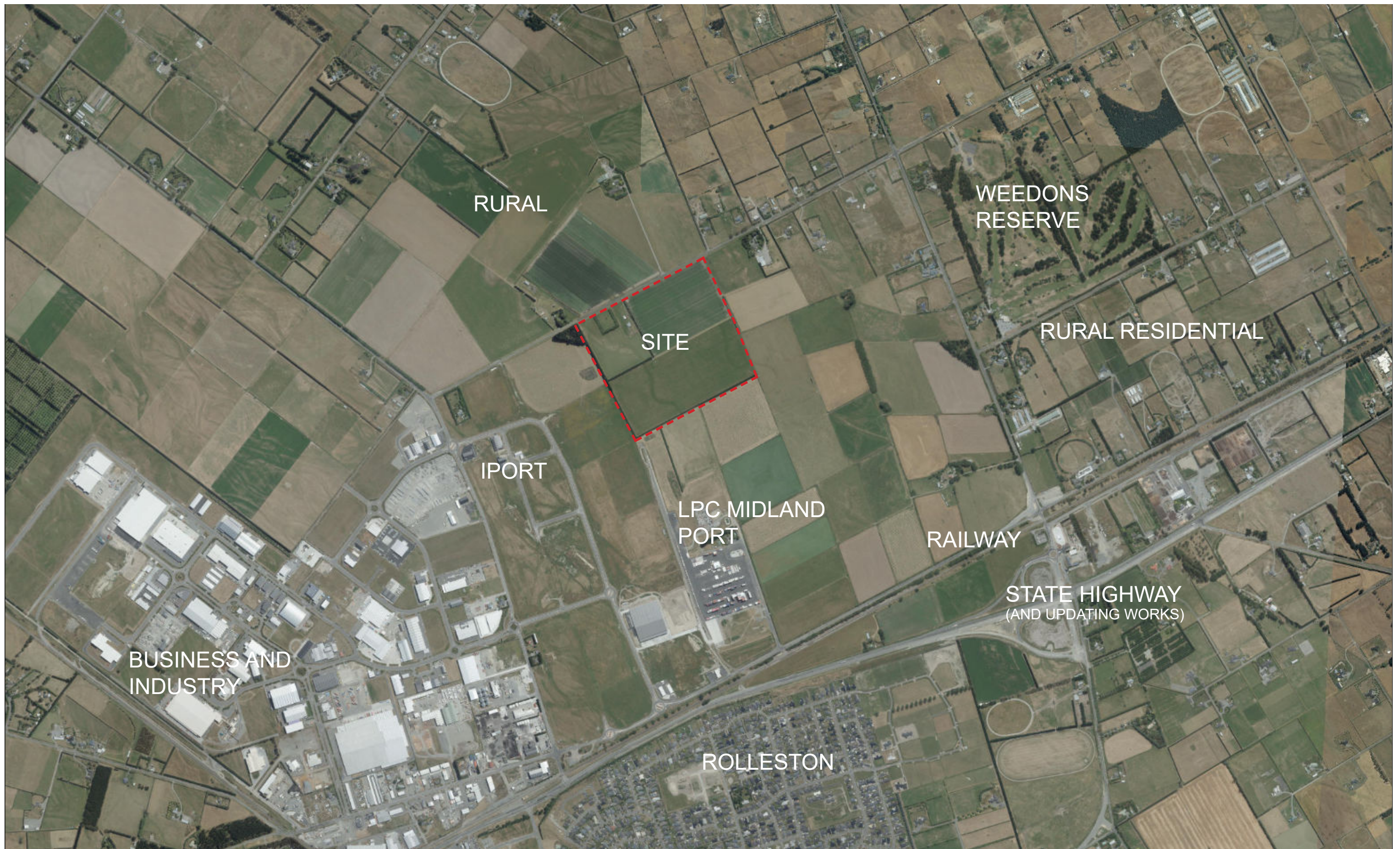
FIGURE 1: Site Location and Context