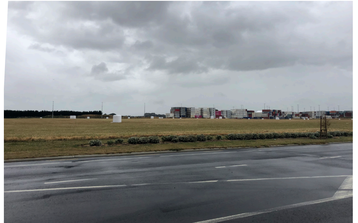
FIGURE 7: View east towards subject site from LPC Midland Port site