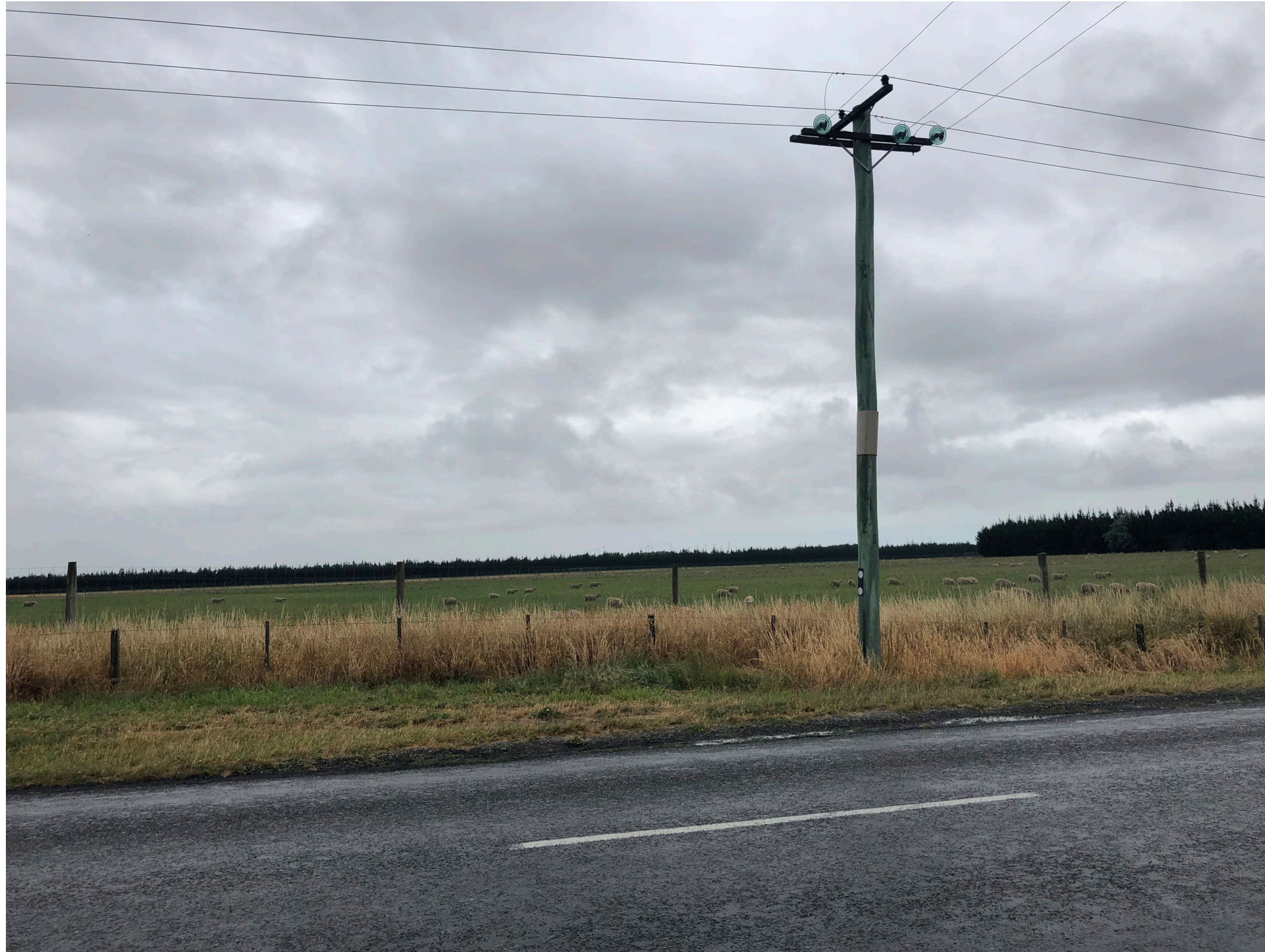
FIGURE 12: View south directly adjacent to subject site from Maddisons Road