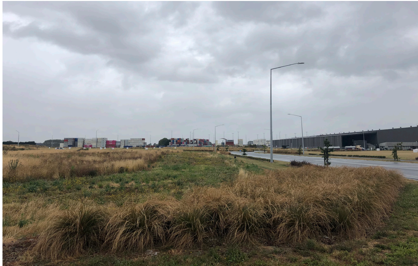
FIGURE 6: LPC Midland Port site existing containers