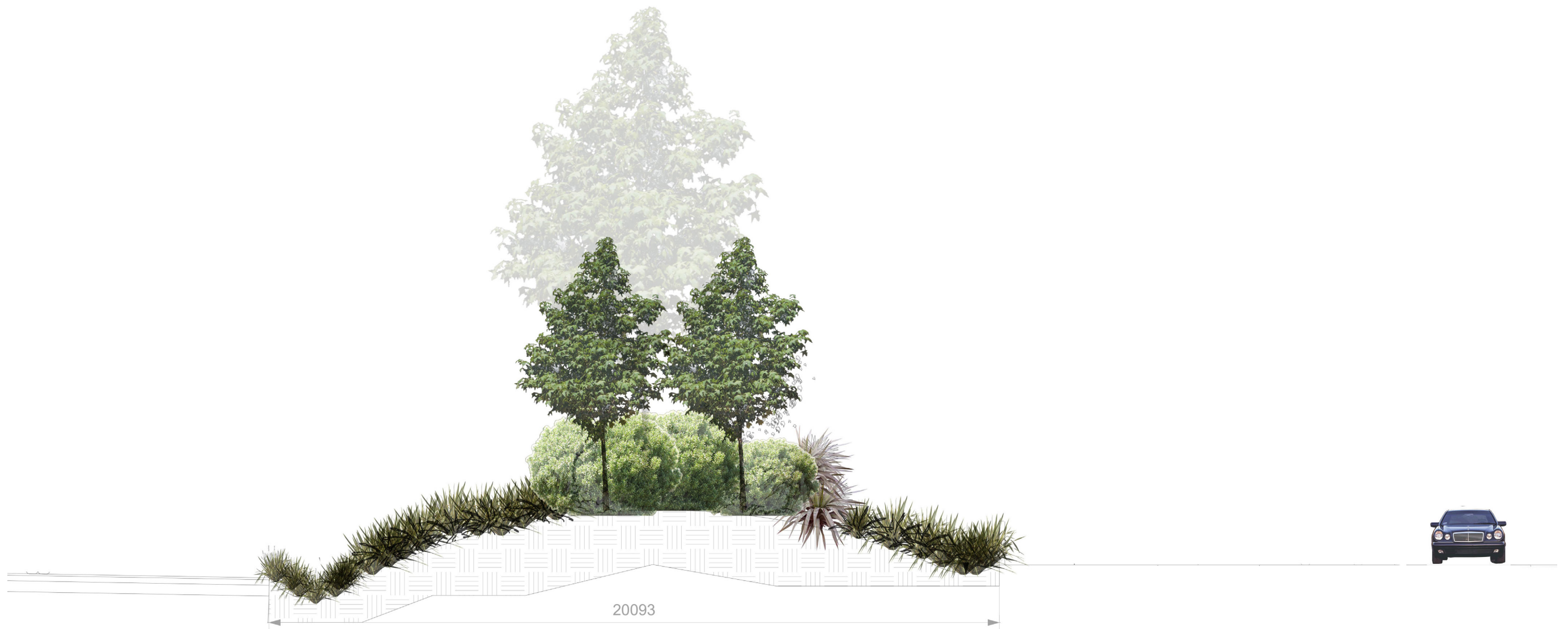
FIGURE 15: Example of mitigation planting / landscape buffering 20-metre-wide landscape bunding with planting shown