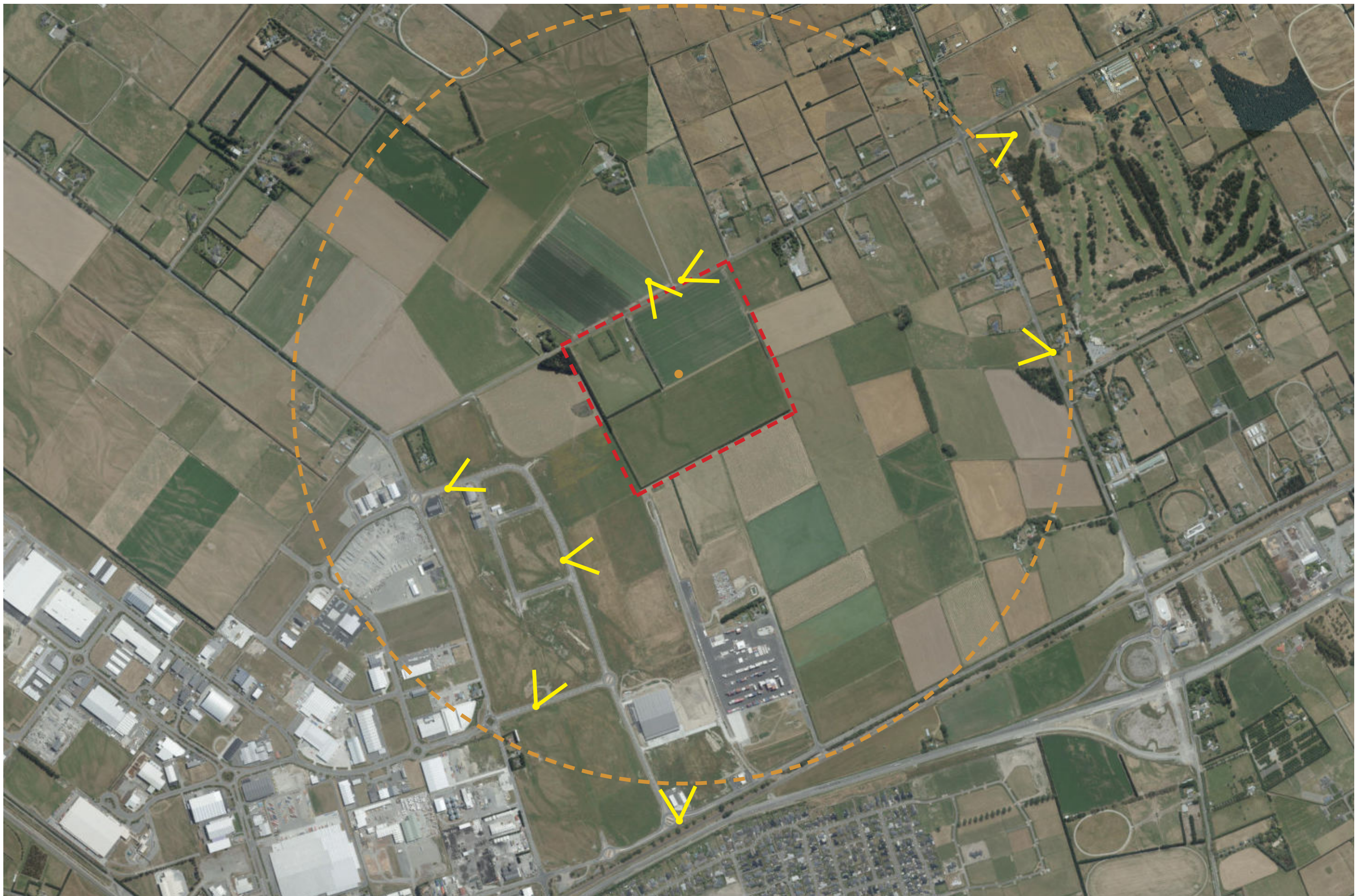
FIGURE 5: Photo Locations and References Circle shown at 1km mark for reference of proximity