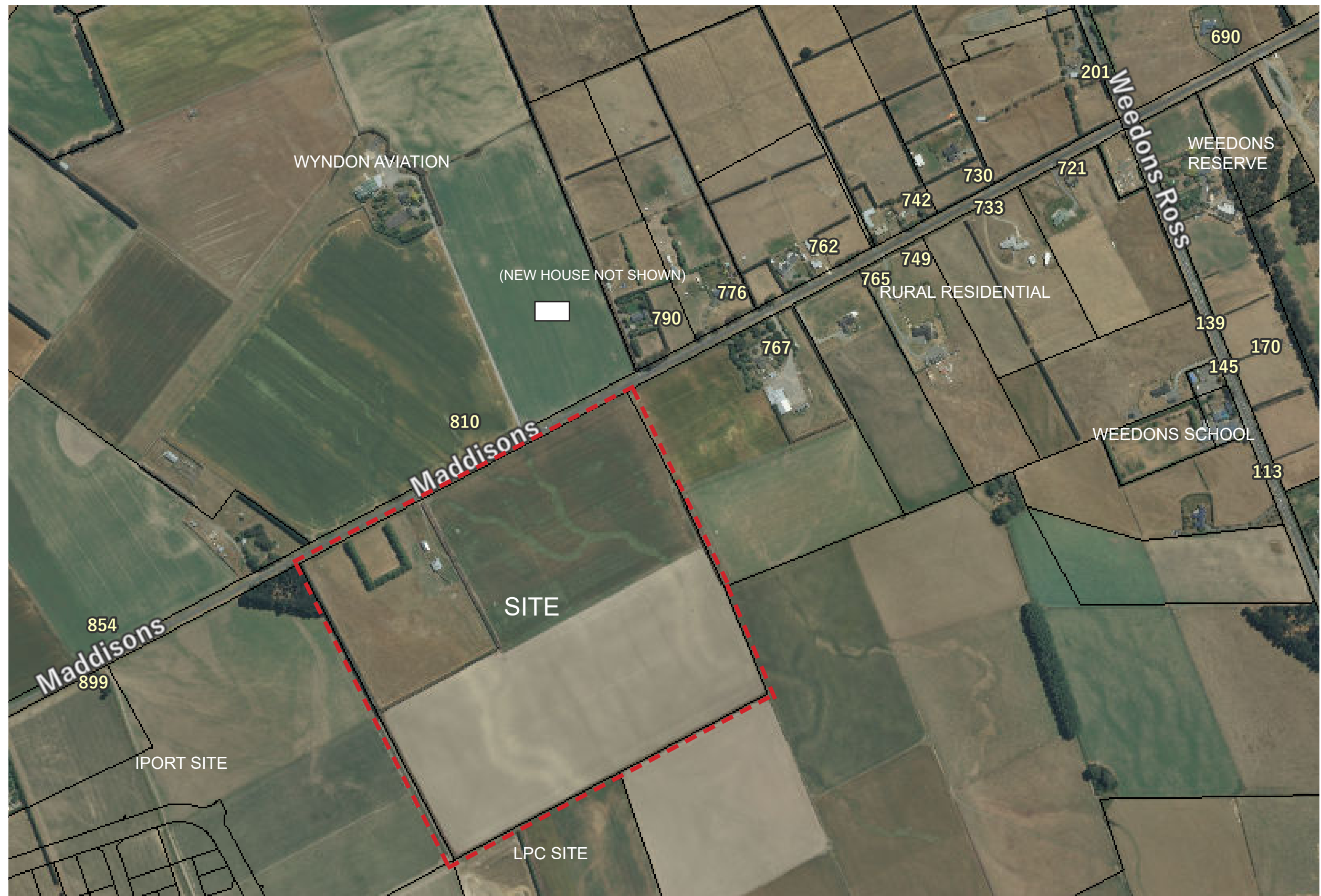
FIGURE 4: Rural residential properties in the vicinity of the subject site Maddisons Road dwellings (and properties numbers) shown. Located in the same rural block or in close(est) vicinity to the subject site.