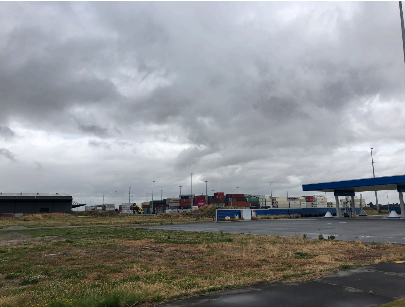
FIGURE 9: View north from Johns Road across LPC site Rail siding entering LPC site from Johns Road - example of rail siding extension that could be present at the DPMA site. Containers in foreground (site not visible). Height from DPMA will probably emerge if built up to heights of 25-55m