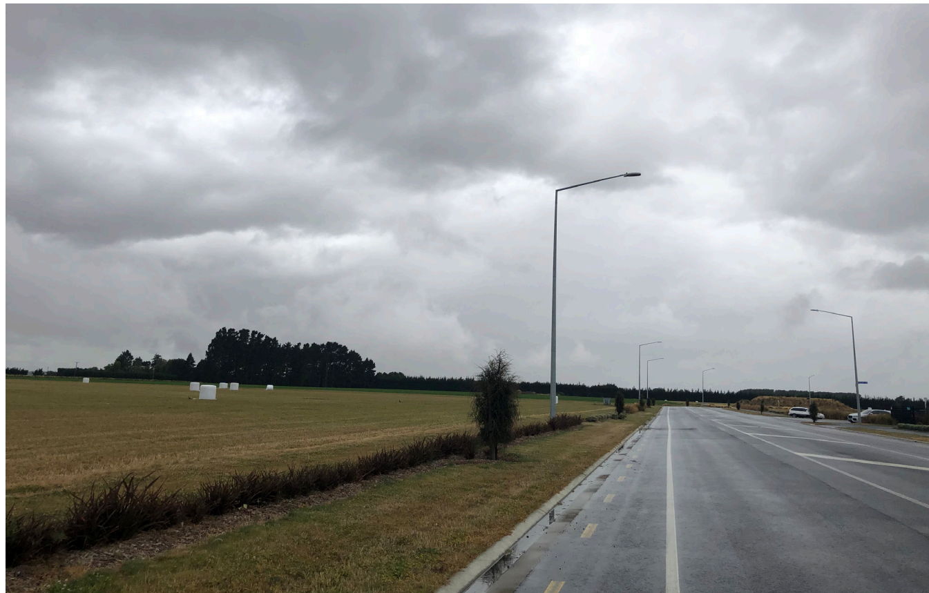
FIGURE 8: View east towards subject site from IPort Drive Road Development shown in foreground. Shelterbelt within subject site shown in background.