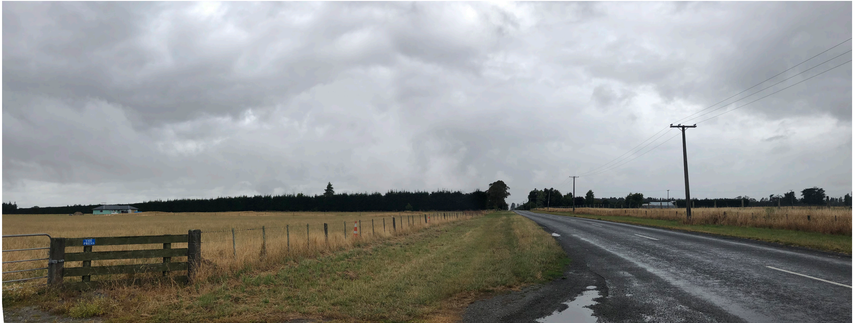
FIGURE 13: View east from Maddison Road

(New) rural residential property shown situated across from the subject site. Farmshed shown east of subject site.