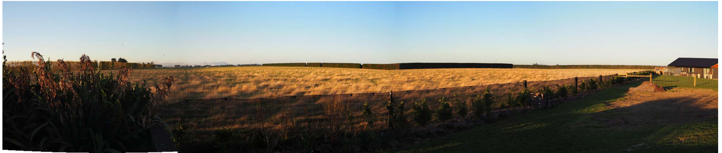
Photograph 20: Area 5 - looking north from Landsborough Drive