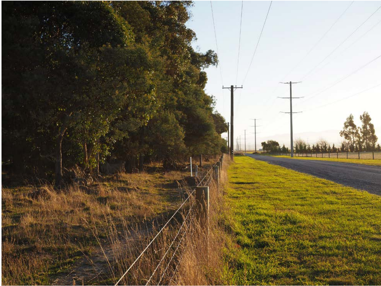
Photograph 17: Area 5 - Homebush Road boundary looking west Taken: 20/05/2019 5:26pm FL: 25