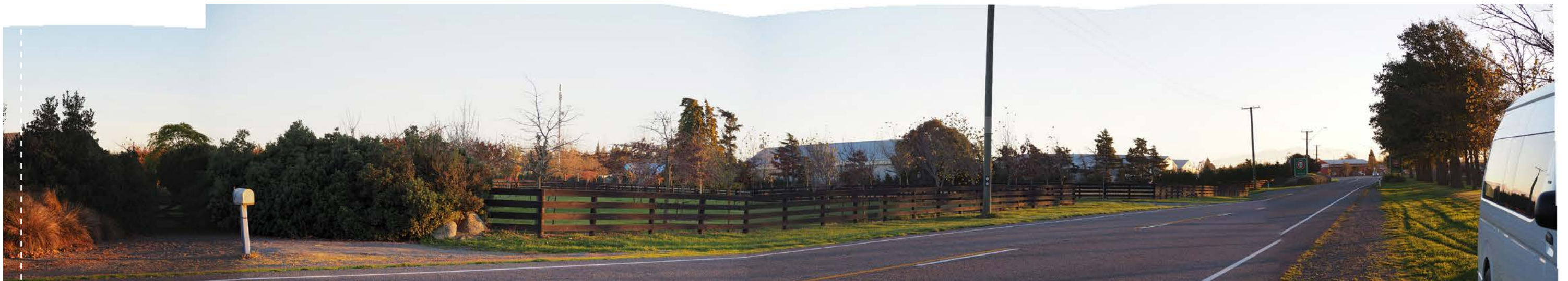
Photograph 12: Area 3 frontage to SH73 looking south Taken: 20/05/2019 5:51pm FL: 25