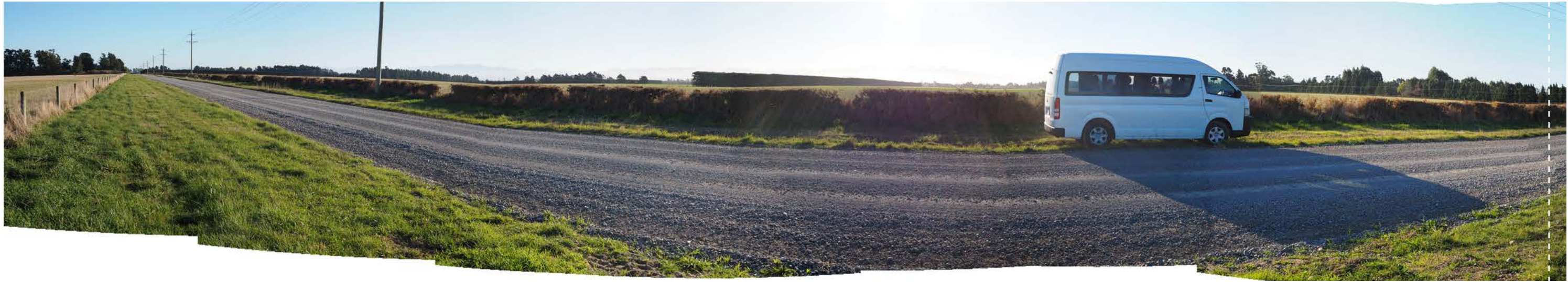
Photograph 8: Area 2 Creyke Road frontage looking northwest Taken: 20/05/2019 4:19pm FL: 25