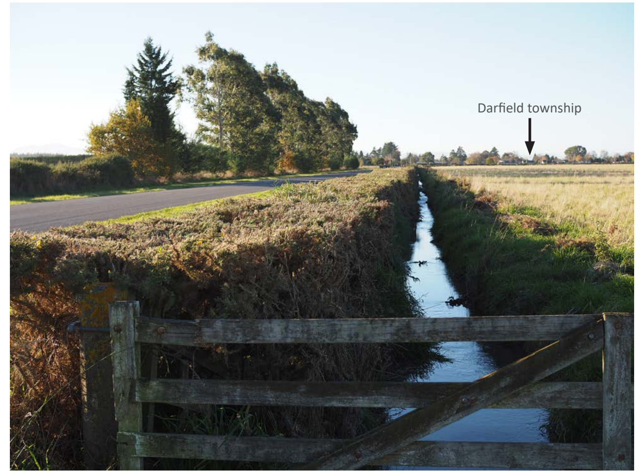
Photograph 4: Area 1 Greendale Road water race looking north Taken: 20/05/2019 4:42pm FL: 25