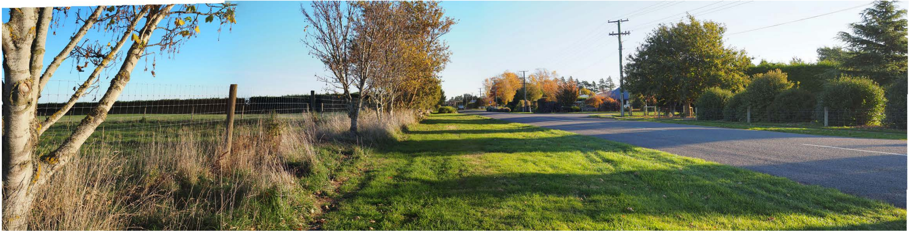
Photograph 10: Area 1 McLaughlins Road looking southwest looking to L2 Zone opposite Taken: 20/05/2019 4:59pm FL: 25