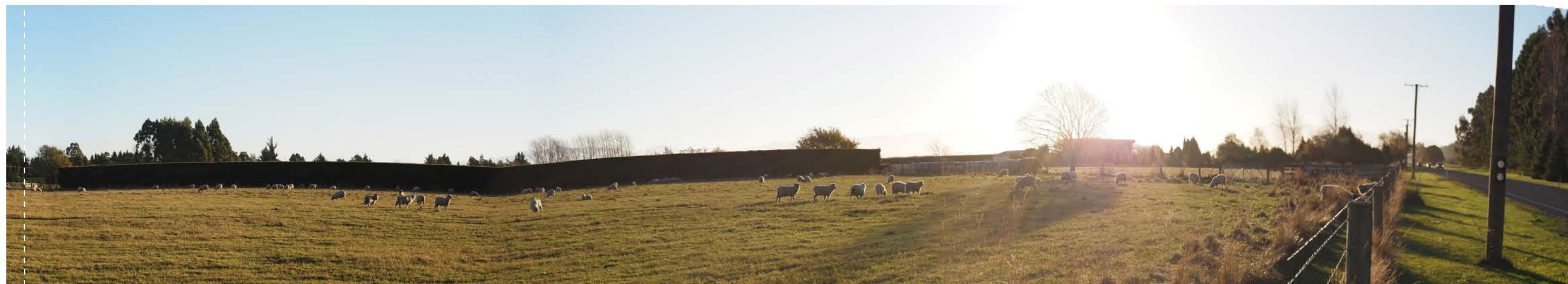
Photograph 13: Area 4A frontage looking southeast from SH73