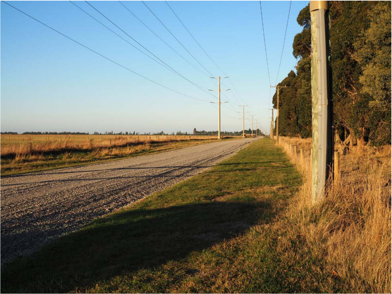
Photograph 18: Area 5 - Homebush Road boundary looking east Taken: 20/05/2019 5:27pm FL: 25