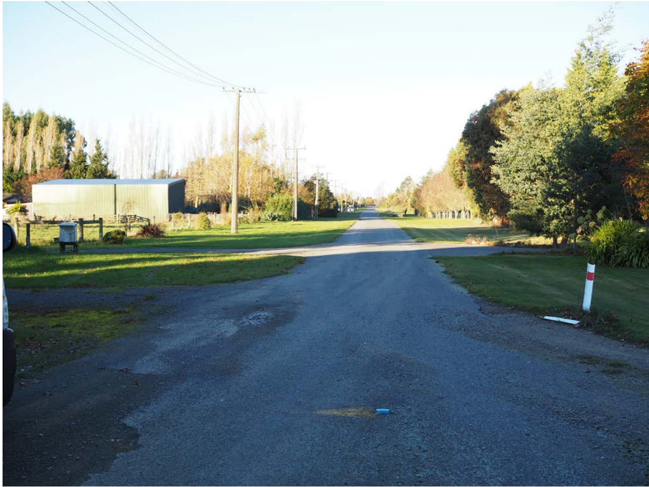
Photograph 14: Cridges Road context - looking east Taken: 20/05/2019 5:12pm FL: 25