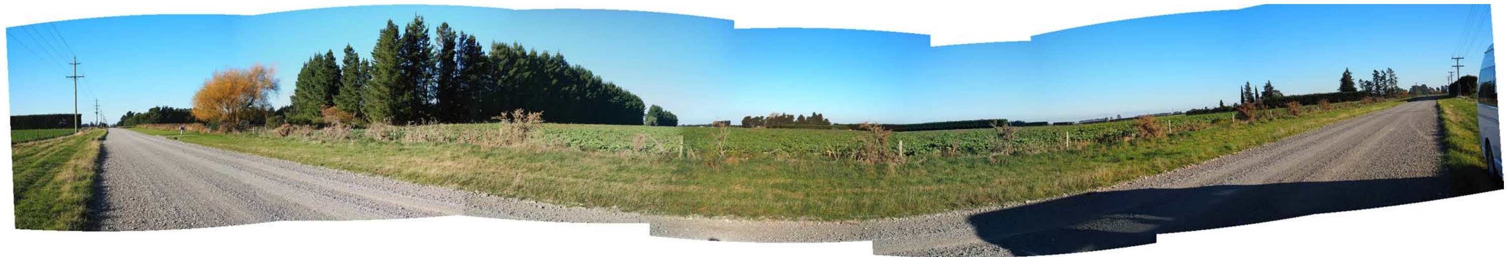
Photograph 7: Area 2 - OP zone interface