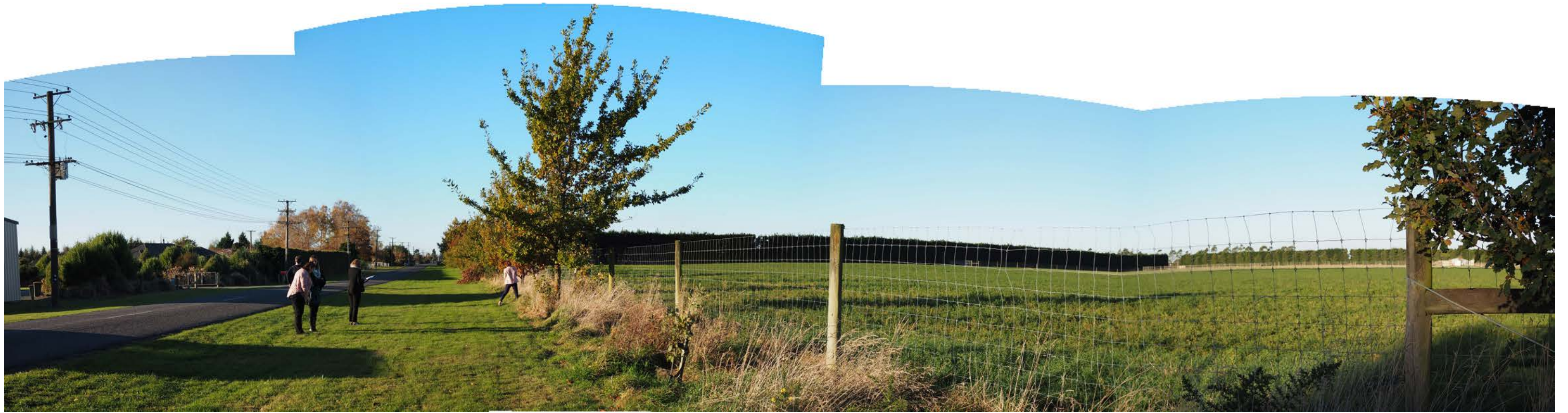
Photograph 1: Area 1 McLaughlins Road frontage looking east. Existing pin oaks along boundary Taken: 20/05/2019 4:54pm FL: 25