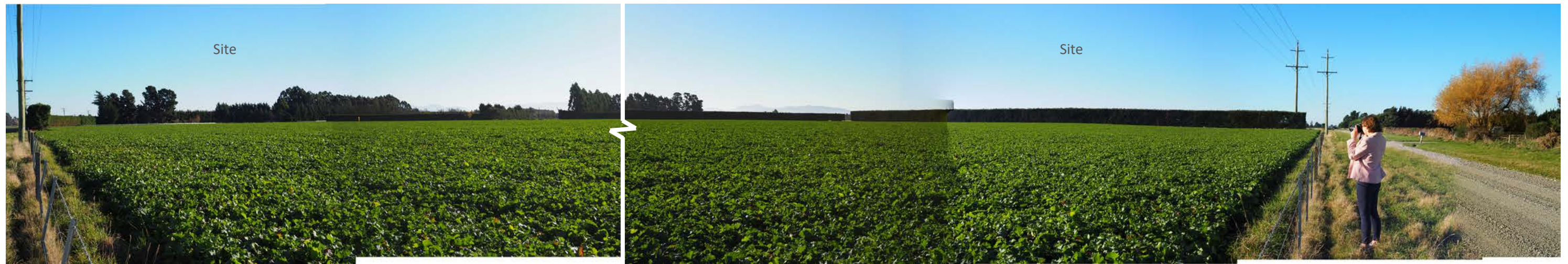
Photograph 6: Area 2 - Creyke Road boundary looking northwest