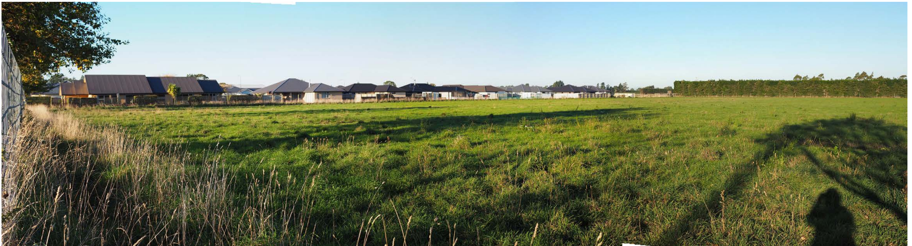
Photograph 11: Area 1 McLaughlins Road L1 interface Taken: 20/05/2019 4:59pm FL: 25