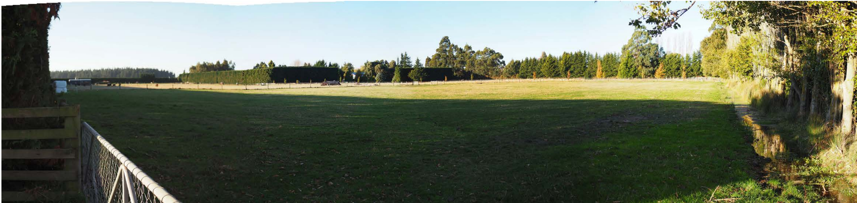
Photograph 16: Area 4B from SH77/Bangor Road looking north Taken: 20/05/2019 5:05pm FL: 25