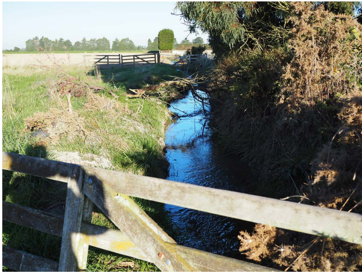
Photograph 3: Area 1 Greendale Road water race looking east Taken: 20/05/2019 4:42pm FL: 25