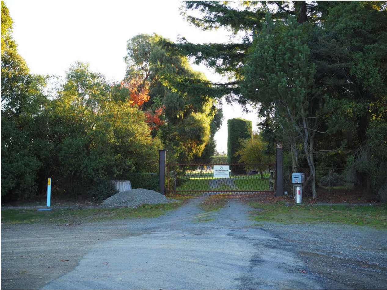
Photograph 15: Area 4B - entry from Cridges Road looking west Taken: 20/05/2019 5:12pm FL: 25