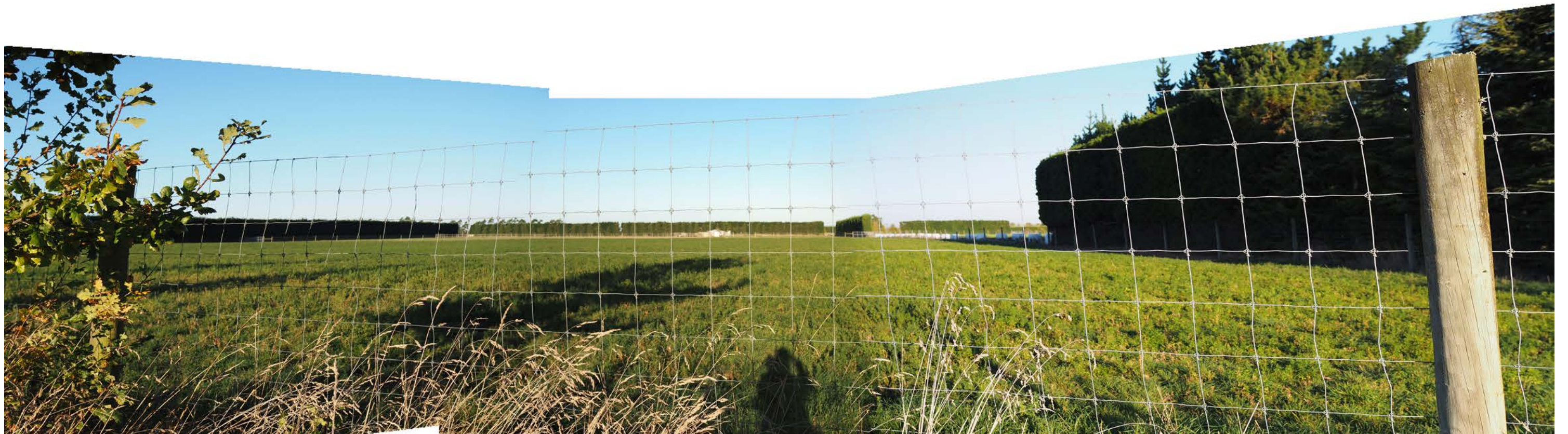
Photograph 2: McLaughlins Road (site) frontage looking east Taken: 20/05/2019 4:55pm FL: 25