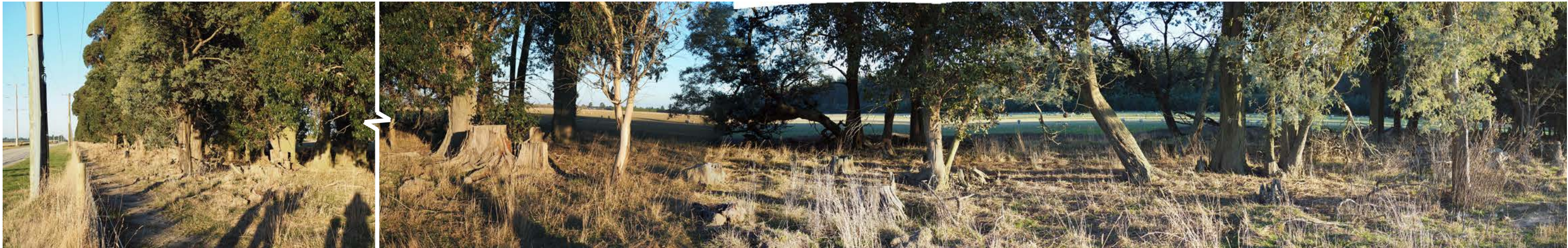
Photgarph 19: Homebush Road boundary looking south into site Taken: 20/05/2019 5:26pm FL: 25