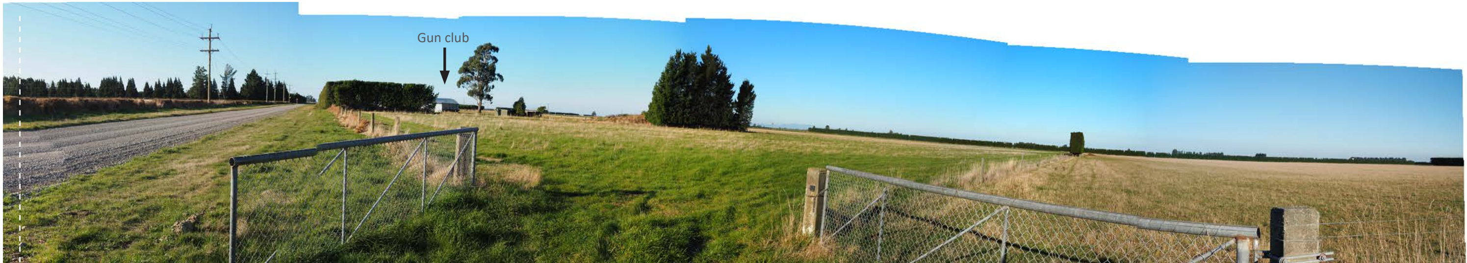
Photograph 9: Area 2 Creyke Road OP zone interface Taken: 20/05/2019 4:19pm FL: 25