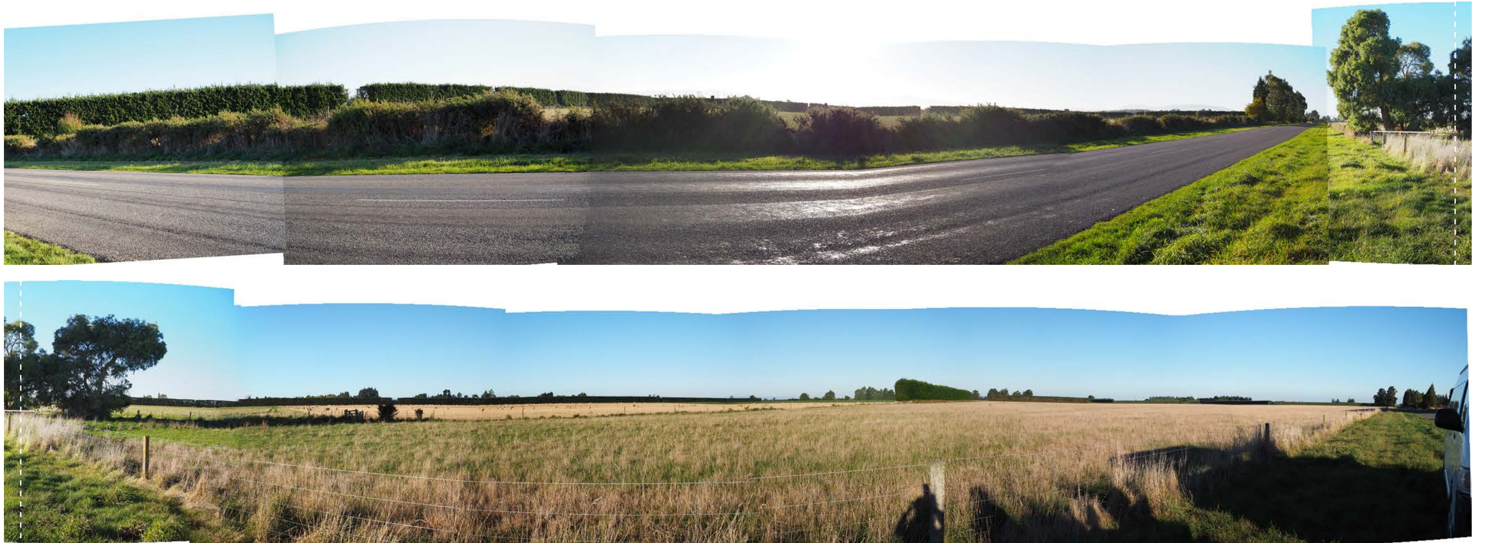
Photograph 5: Area 1-2 Greendale Road frontage looking west-east Taken: 20/05/2019 4:36pm FL: 25