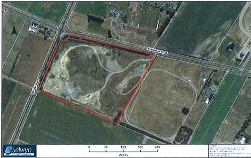
Robinsons Pit Lease Area