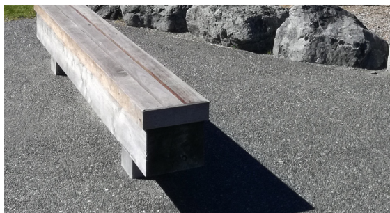
Chunky hardwood timber seating, paving and boulders.