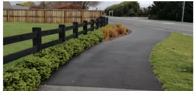
Post and rail fencing located in earlier stages of Flemington

The landscape design takes cues from the local and surrounding landscape, it's rural context and the Lincoln and Flemington communities. Materials, planting, fencing and pedestrian nodes are all influenced by the local vernacular. The use of timber post and rail, durable paving material and plants endemic to the local area will strengthen the design in this space.