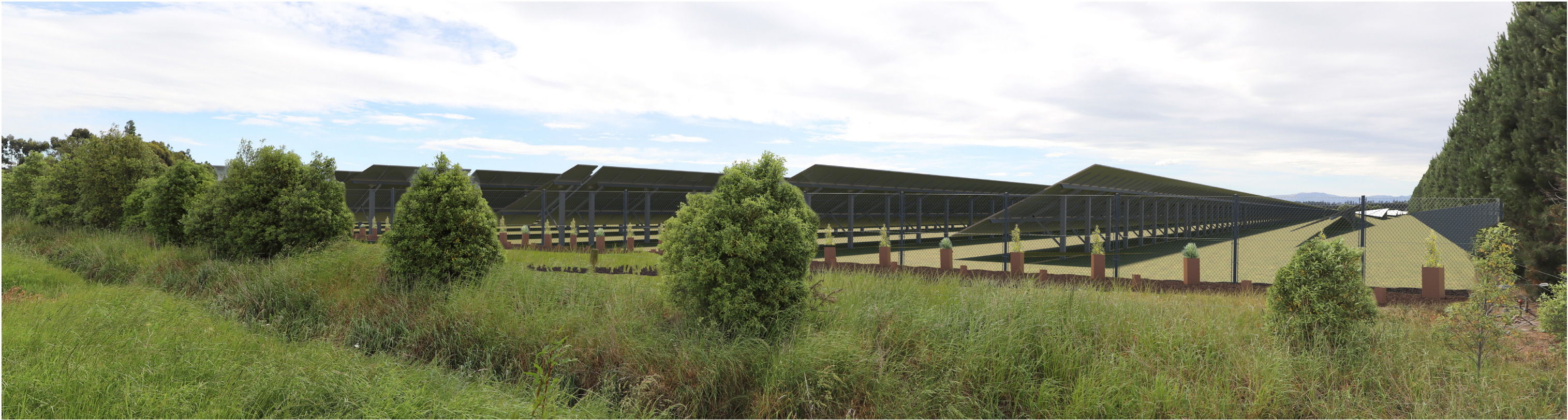
Proposed View after 1 year