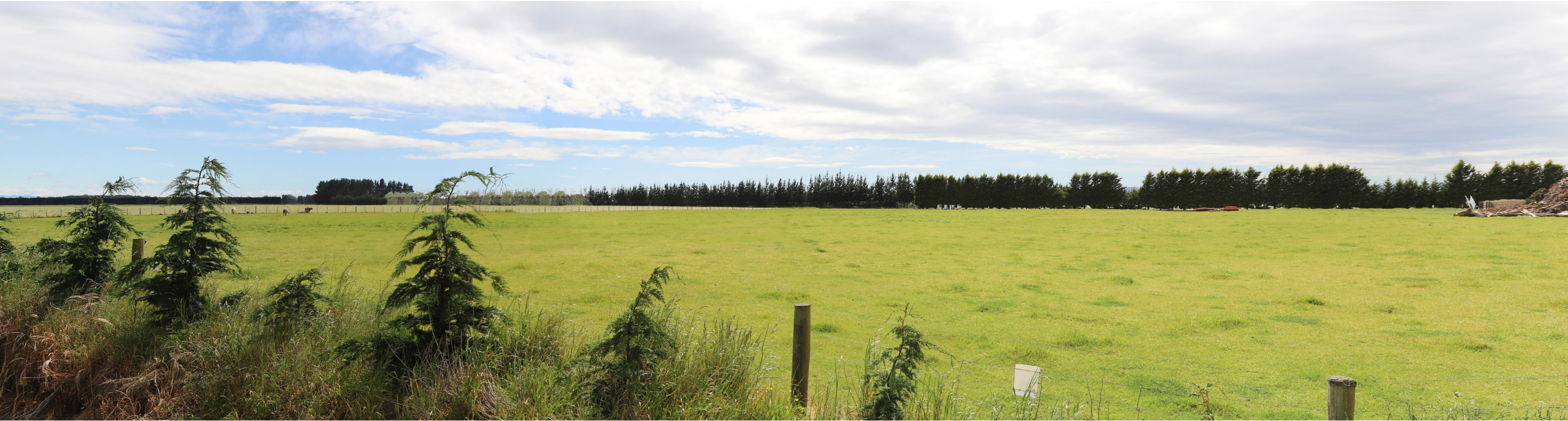
Proposed View after 5 years