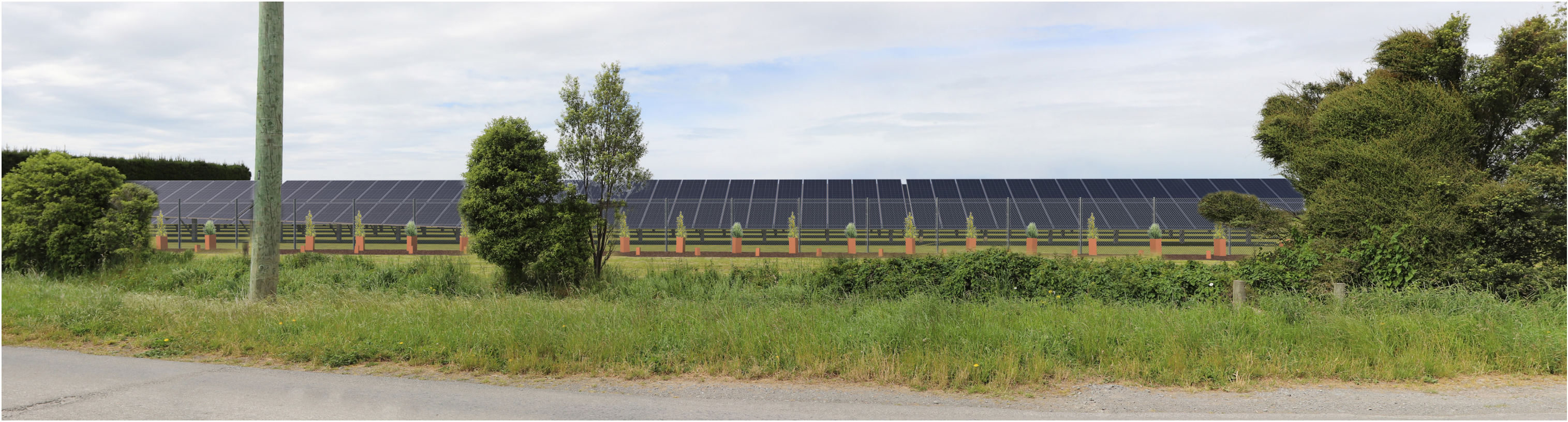
Proposed View after 1 year