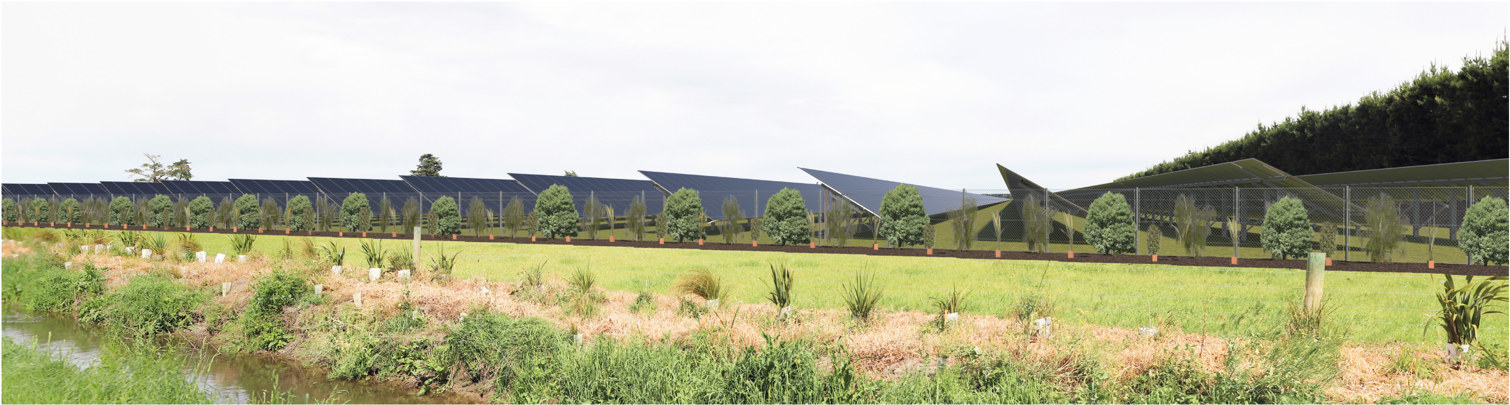
Proposed View after 2 years