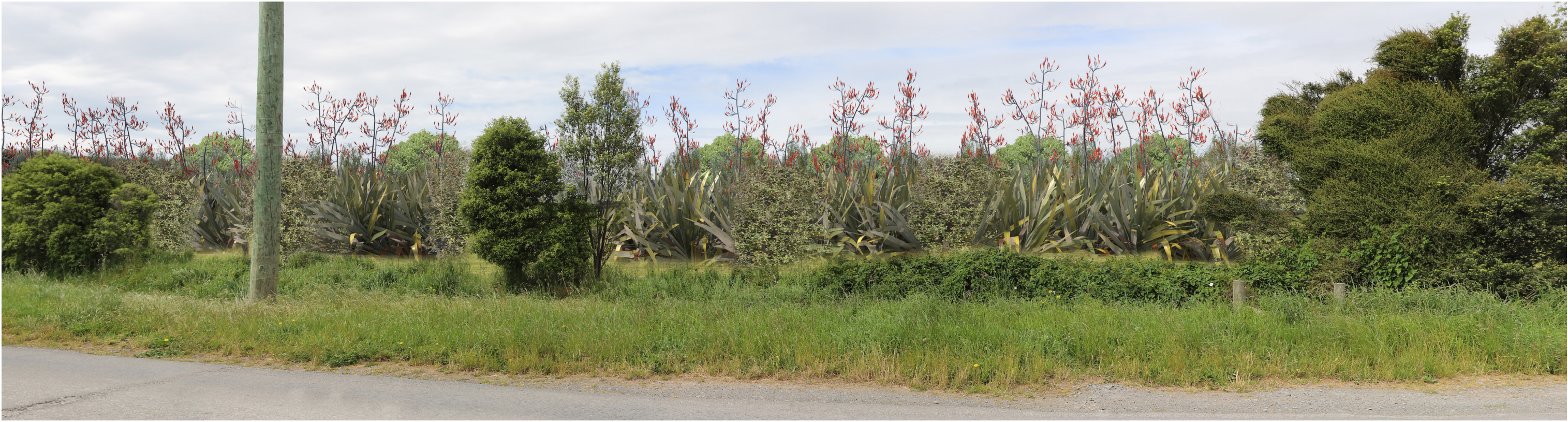
Proposed View after 5 years