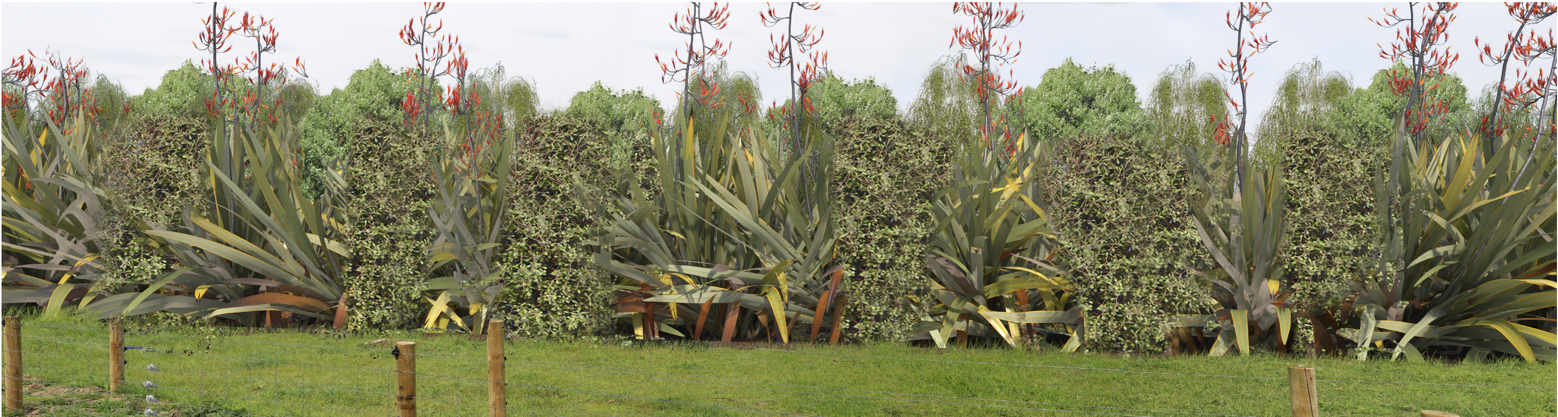
Proposed View after 5 years