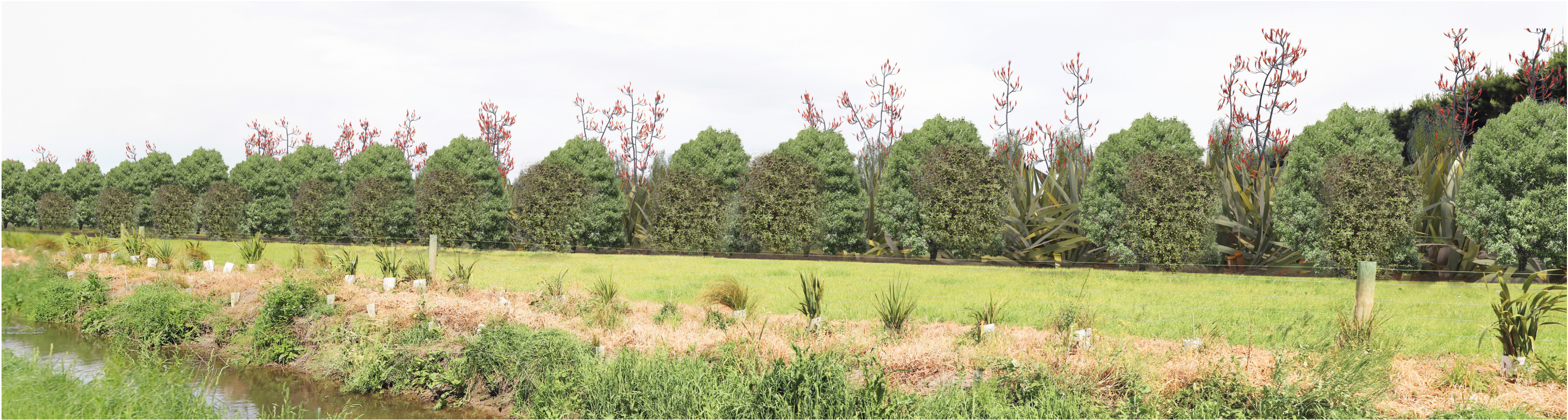
Proposed View after 5 years