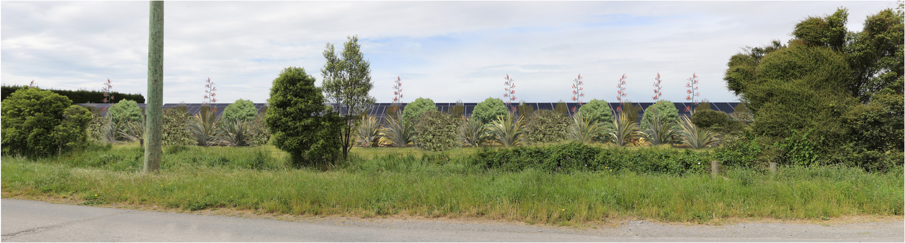
Proposed View after 3 years