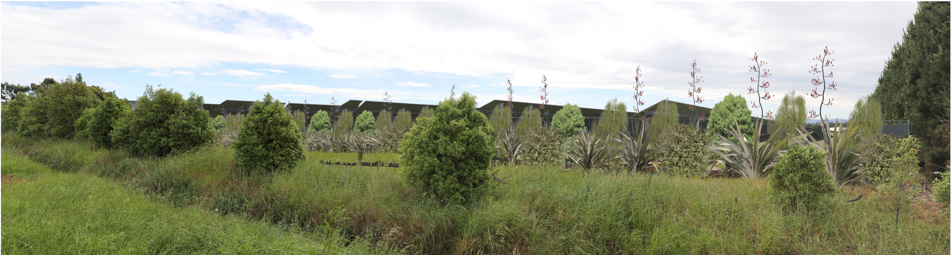
Proposed View after 3 years