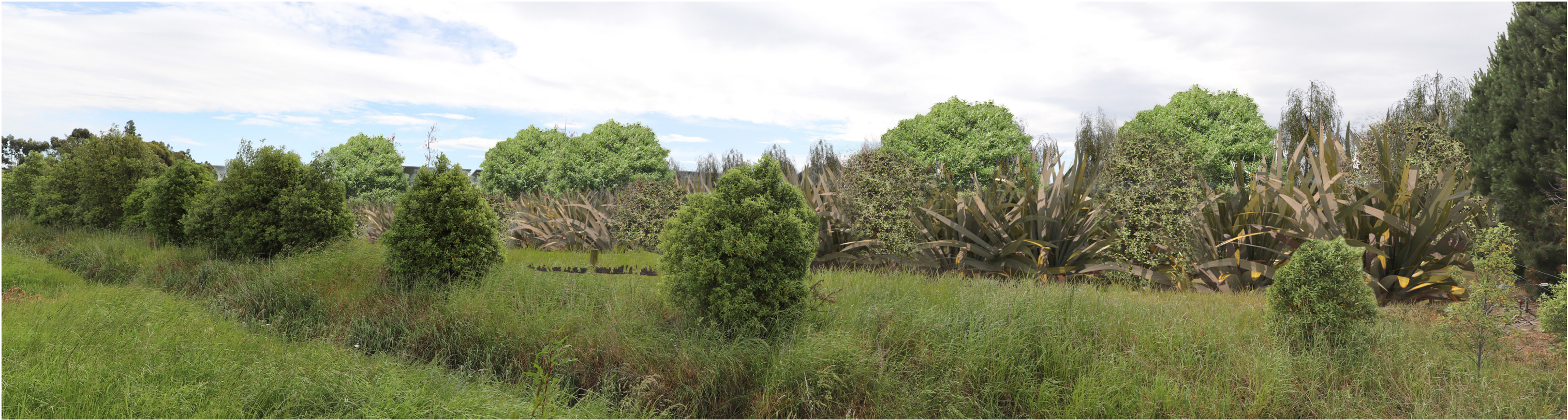
Proposed View after 5 years