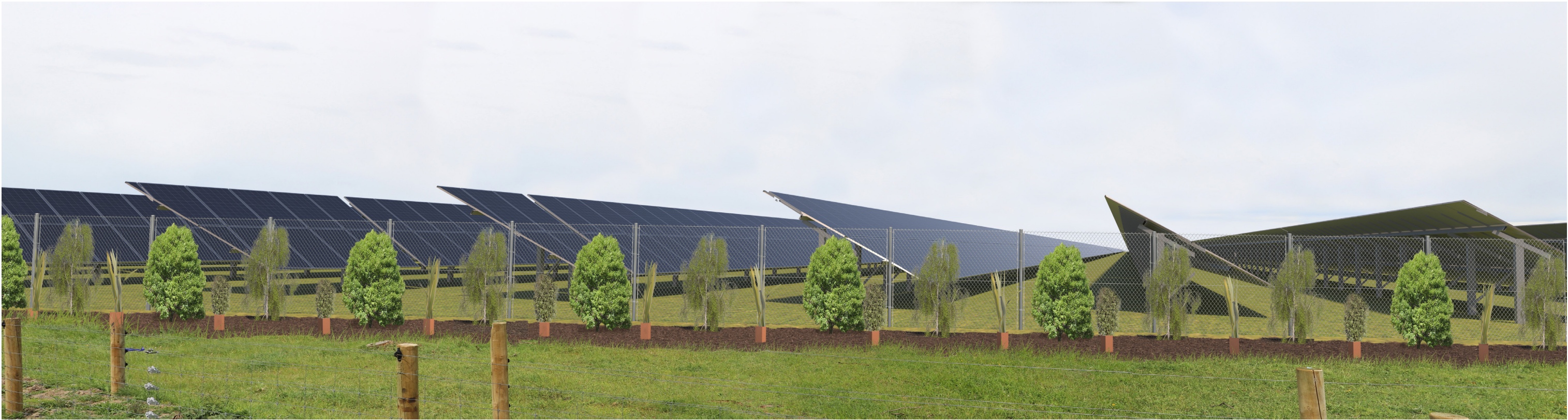
Proposed View after 2 years