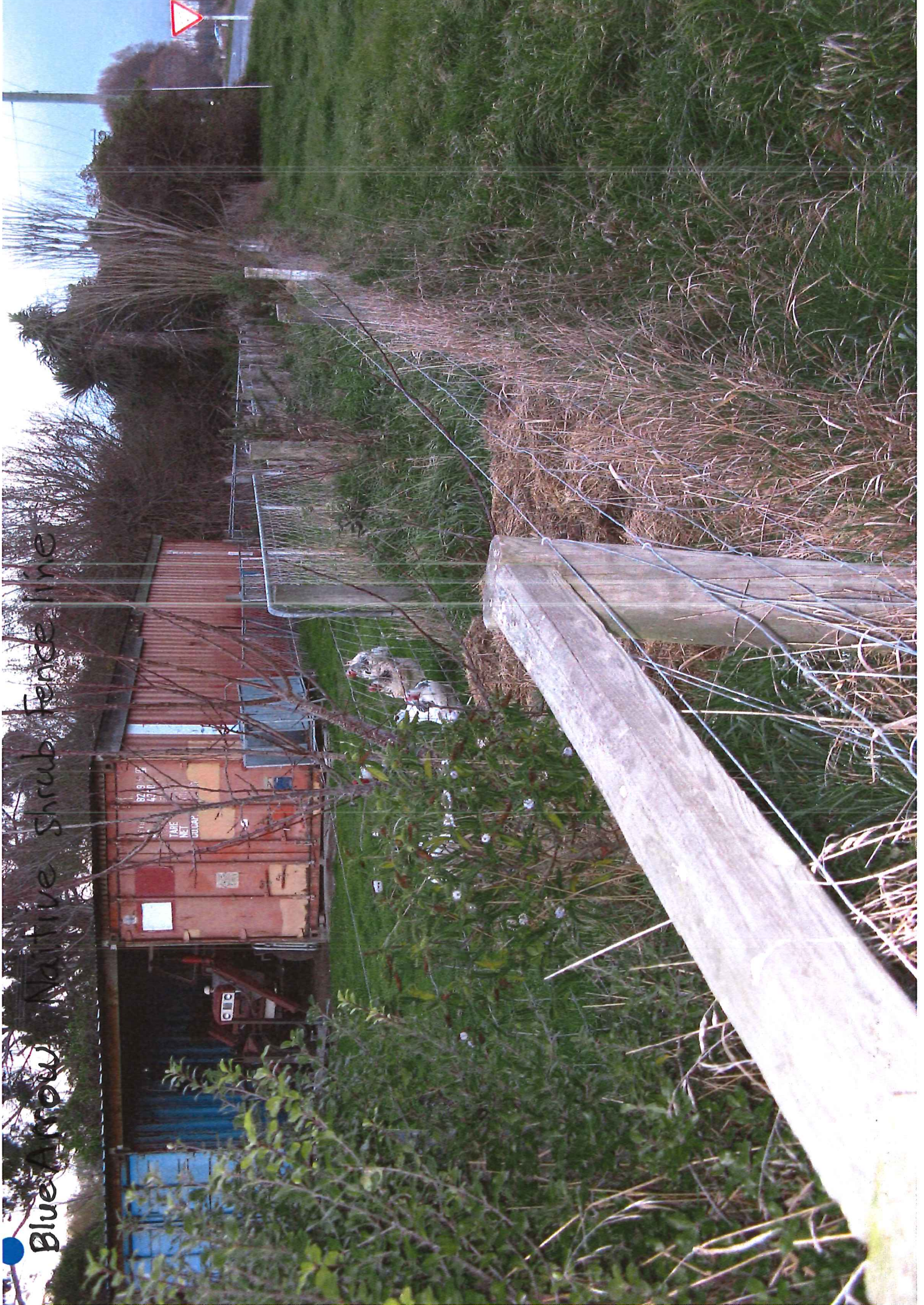
Blue Arrow Native Shrub Fence line