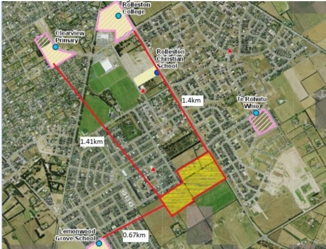
Figure 2: Proposed subdivision's proximity to Schools

and the effect this may have on the nearby schools.