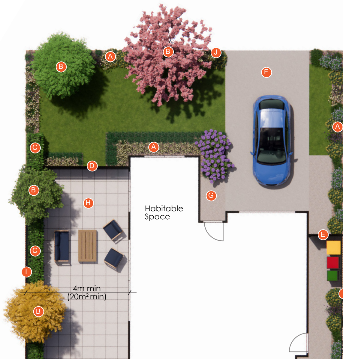
A. TYPICAL PLAN VIEW (1:100 @A3)