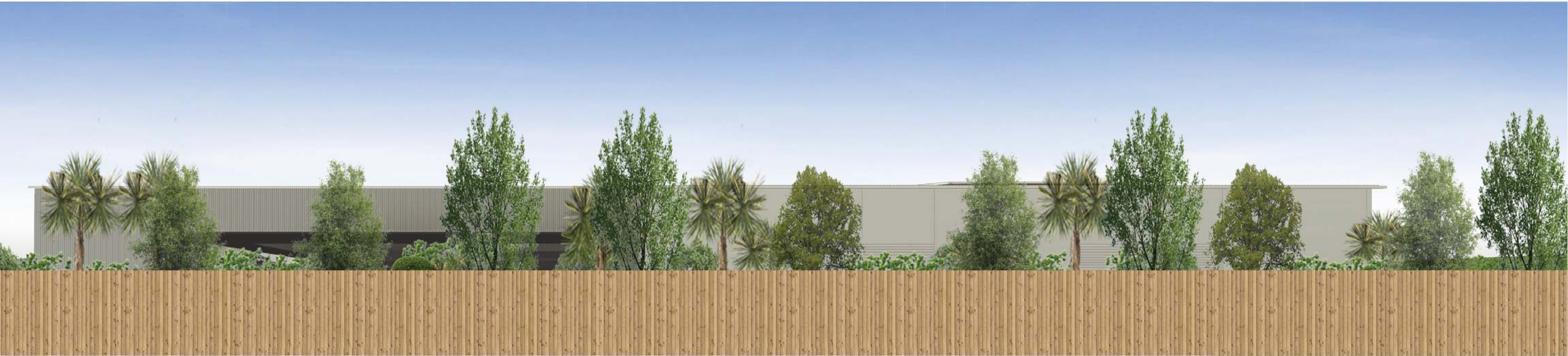
Planting shown at 10 year growth Mountain Beech (6m high), Ribbonwood (8m high), Kowhai (8m high) and Cabbage Trees (8m high).

Proposed landscaping and boundary interface should the adjacent land to the east remain in the General Rural Zone under the PSDP.