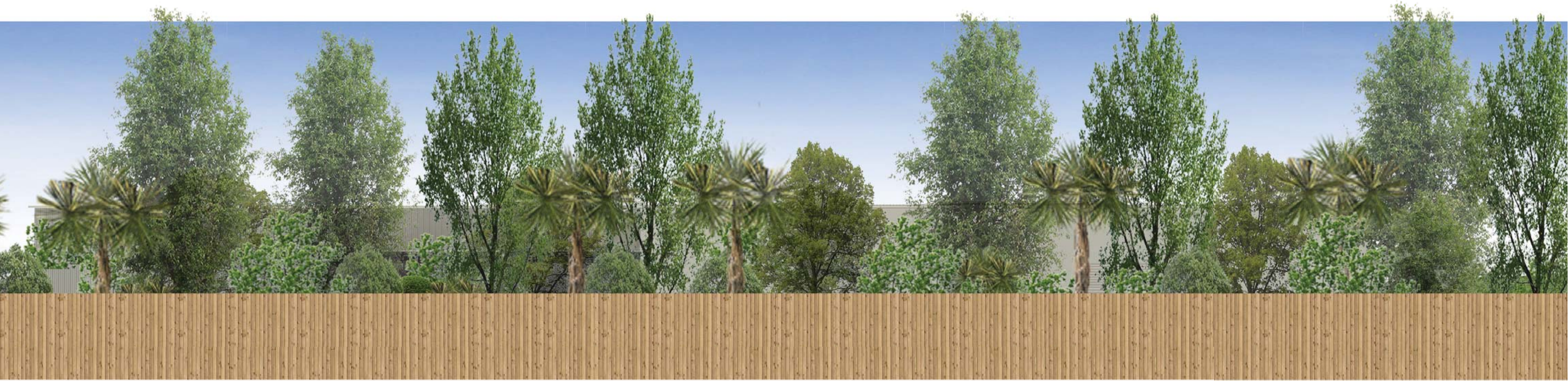
Planting shown at maturity (30 years+) Mountain Beech (12m high), Ribbonwood (12m high), Kowhai (8m high) and Cabbage Trees (10m high).

NOTE: The render shows a 2.0m high acoustic timber fence on top of a 0.6m high retaining wall on the eastern boundary. The tree planting includes: Mountain Beech (red dot), Ribbonwood (blue dot), Kowhai (yellow dot) and Cabbage Trees (interspersed). The shrub planting includes a mix of tall and short shrub planting and groundcovers.