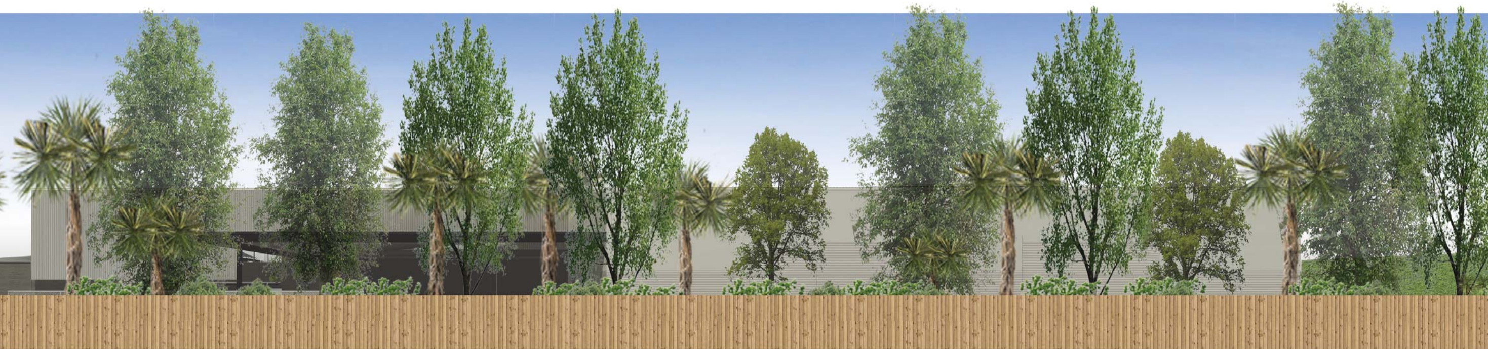
Planting shown at maturity (30 years+) Mountain Beech (12m high), Ribbonwood (12m high), Kowhai (8m high) and Cabbage Trees (10m high).

NOTE: The render shows a 2.0m high timber paling fence on the eastern boundary. The tree planting includes: Mountain Beech (red dot), Ribbonwood (blue dot), Kowhai (yellow dot) and Cabbage Trees (interspersed). The shrub planting includes only short shrub planting (2m high max) and groundcovers.