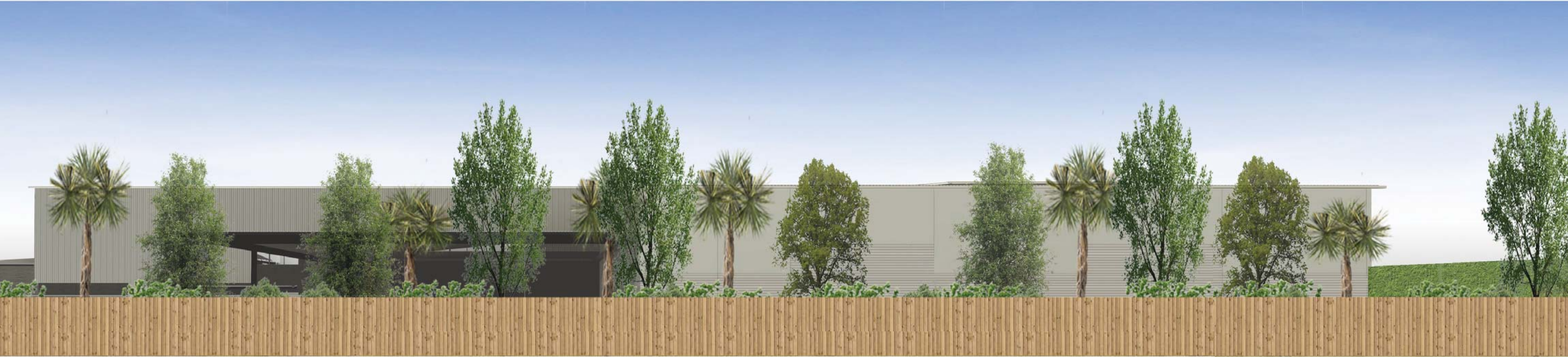
Planting shown at 10 year growth Mountain Beech (6m high), Ribbonwood (8m high), Kowhai (8m high) and Cabbage Trees (8m high).

Proposed landscaping and boundary interface should the adjacent land to the east be rezoned to General Residential Zone under the PC17.