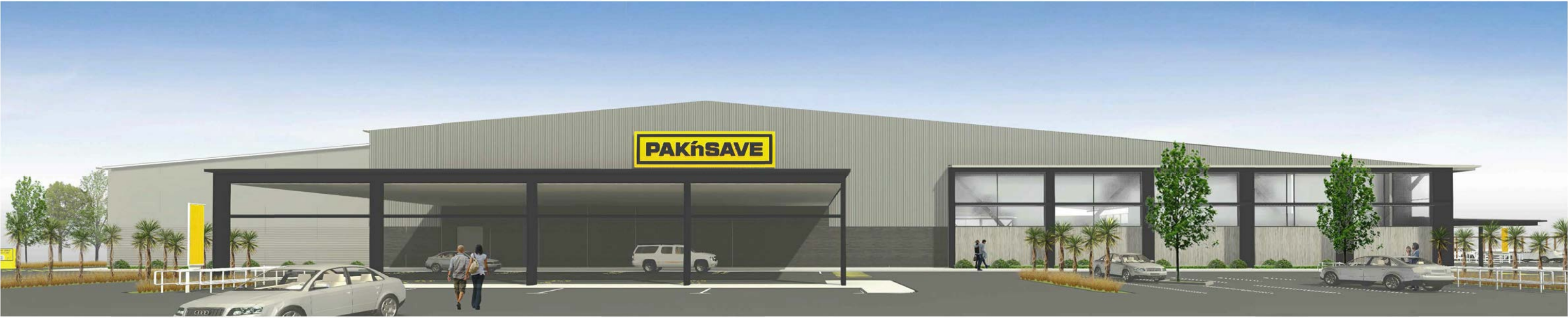
North West Perspective Elevation