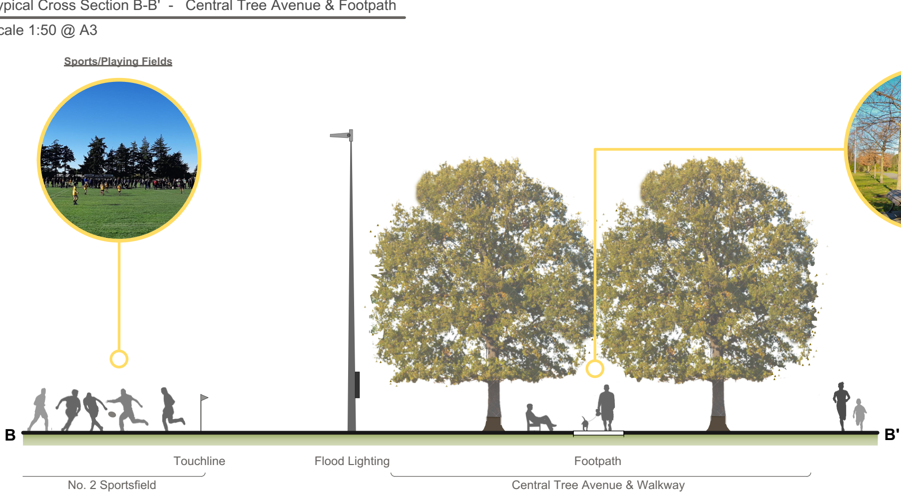
Central Tree Avenue & Walkway Avenue of larger deciduous specimen trees, limbed to allow visibility across reserve, lining either side of a formed pathway that links to melenium walkway/Hoskyns Rd