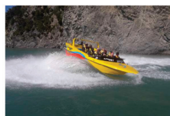
Alpine Jet Thrills Springfield / Adventure

You now have access to add new business listings and manage your existing listings to ensure they are up-to-date and engaging.