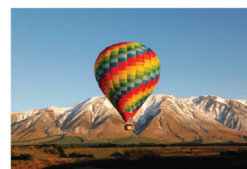
Ballooning Canterbury Darfield / Air Activities