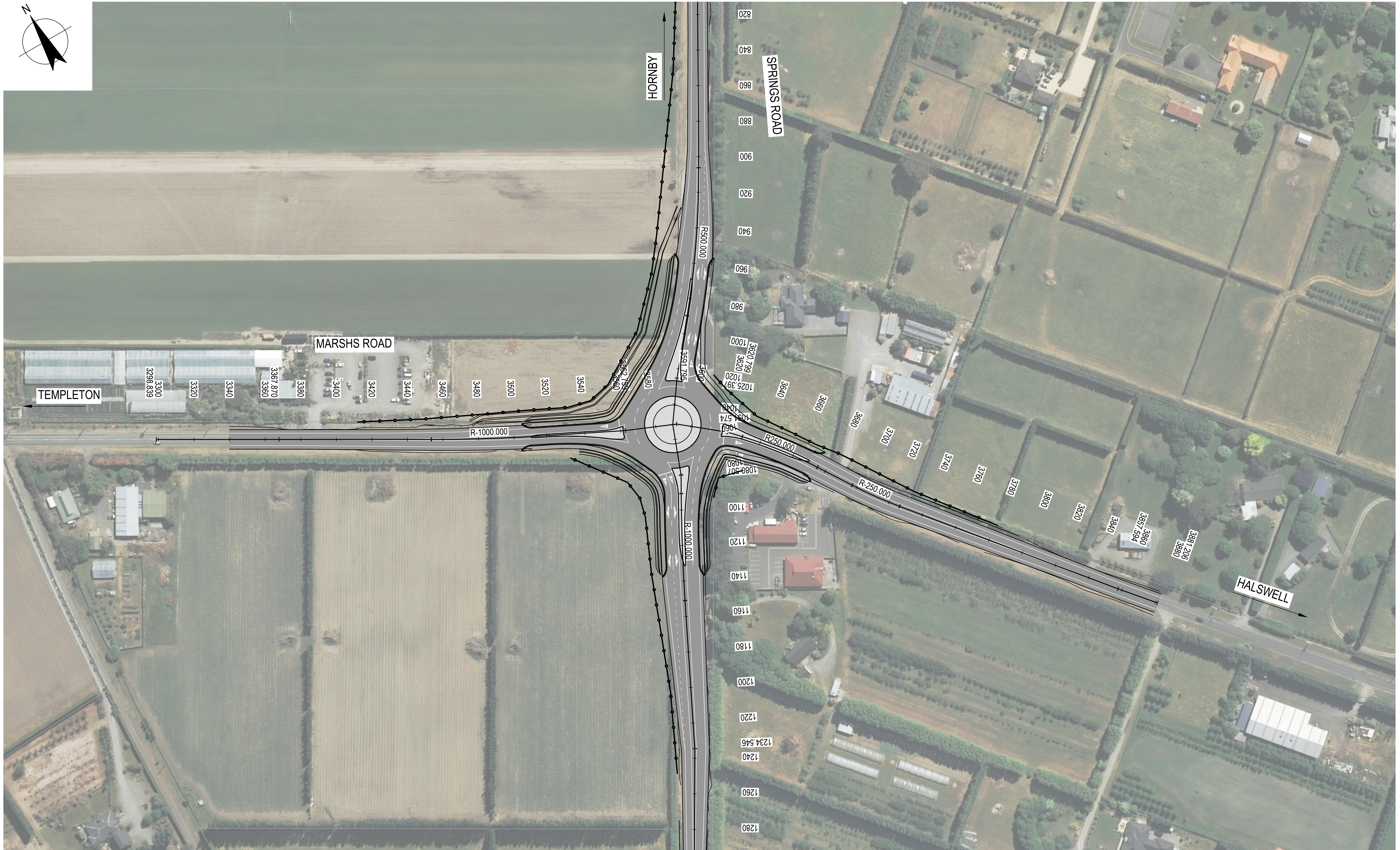
LOCATION PLAN SCALE 1:1000