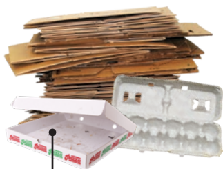
Empty flattened cardboard