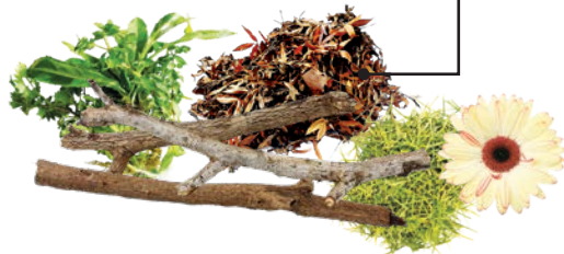
Garden prunings, clippings and leaves

Tips to ensure your bin gets emptied and to help avoid contamination at the compost processing plant: