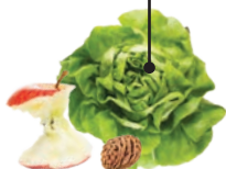
Fruit and vegetables