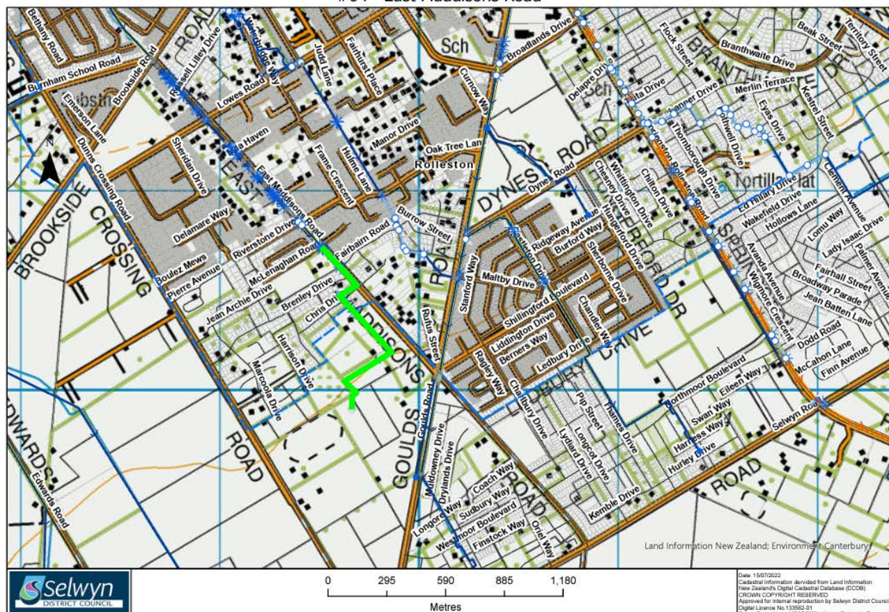
#04 - East Maddisons Road