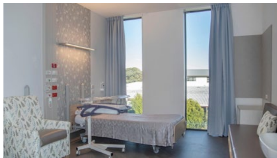
Inside the new birthing unit at Toka Hapāi Selwyn Health Hub