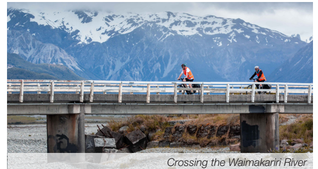
Crossing the Waimakariri River