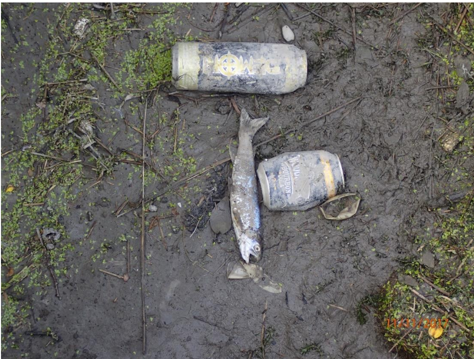
Picture 2 We would like none of this